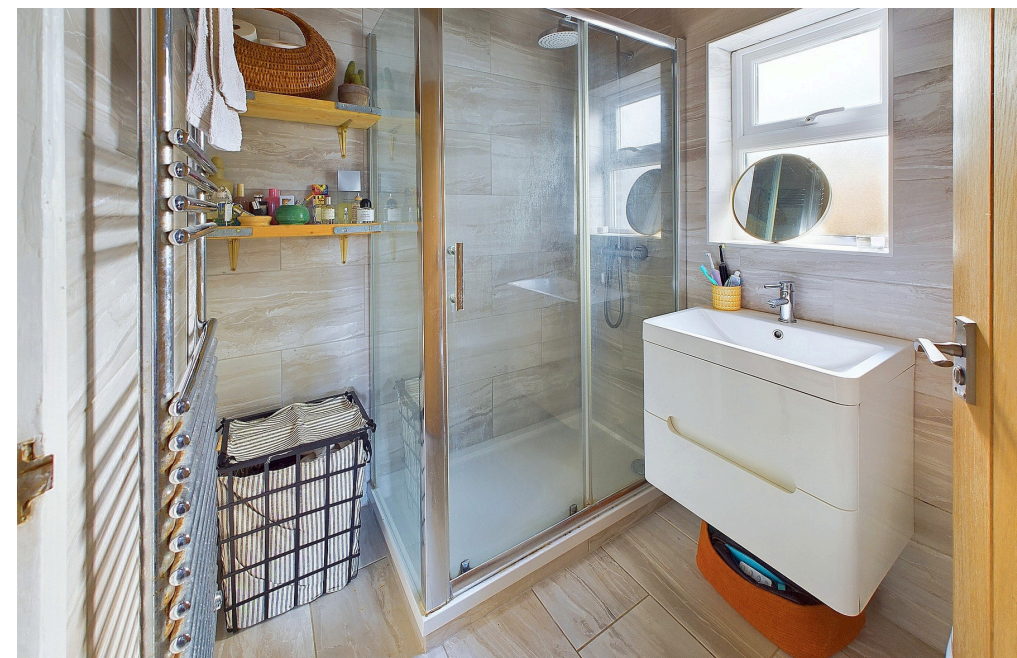
Property details: Victoria Road | Southwick | BN42 4DJ