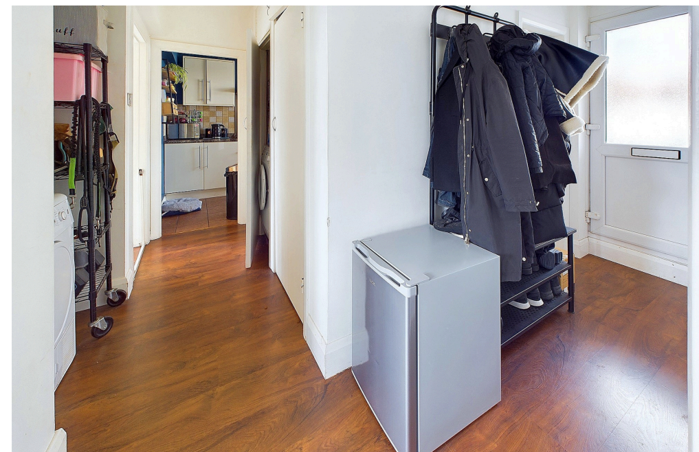
Property details: Riverside House, High Street | Shoreham by Sea | BN43 5DW