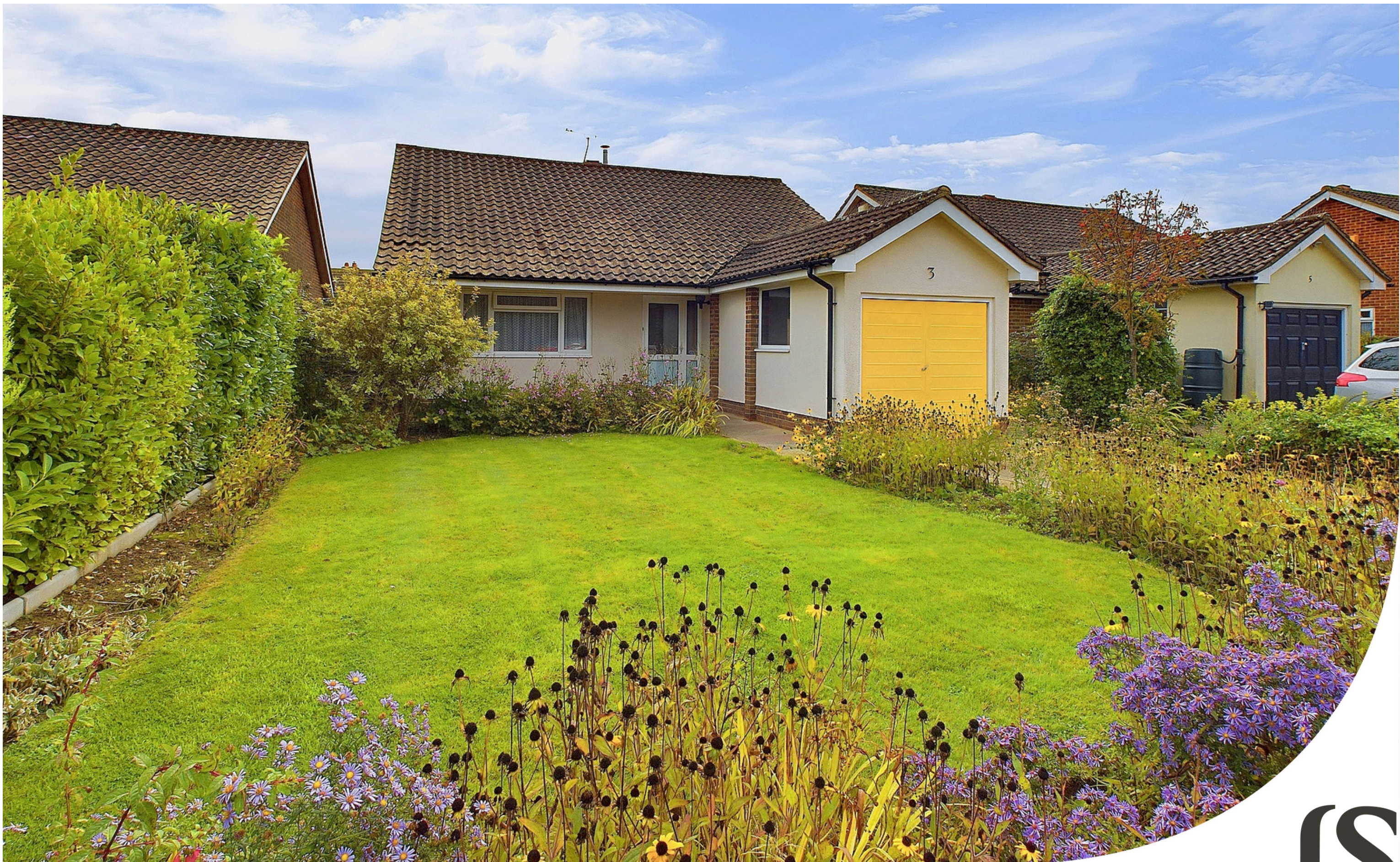
Greystone Avenue, Worthing, BN13 1LR ( Asking Price £435,000