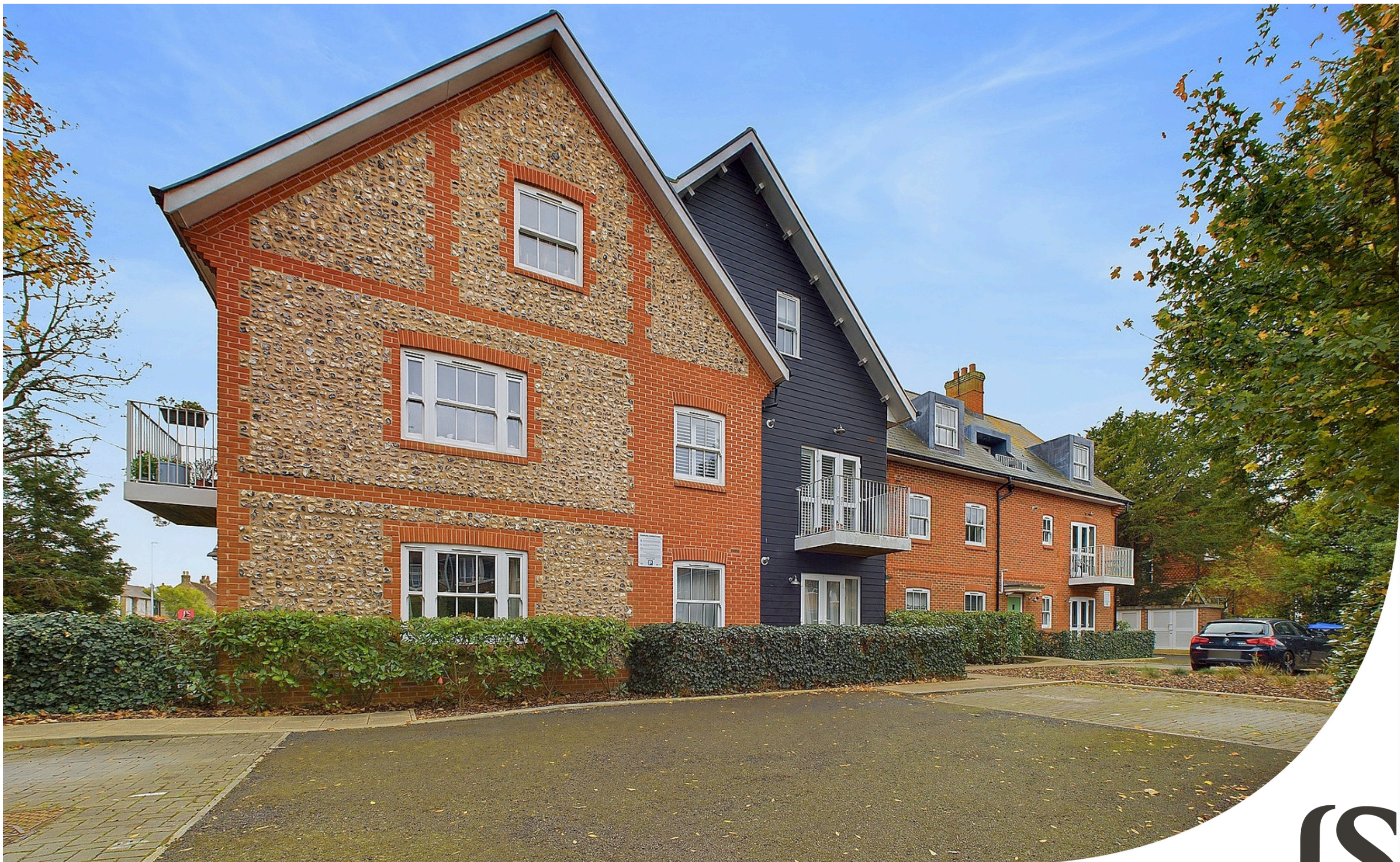
Irene House, 1 Parkfield Road, Worthing, BN13 1FB Asking Price of £285,000