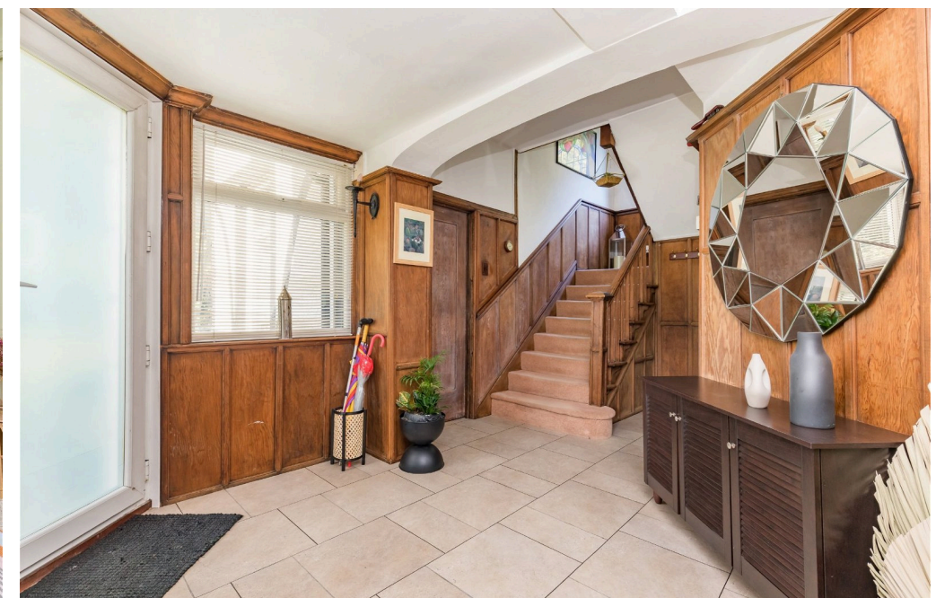
Property details: Warren Road | Offington | BN14 9QX