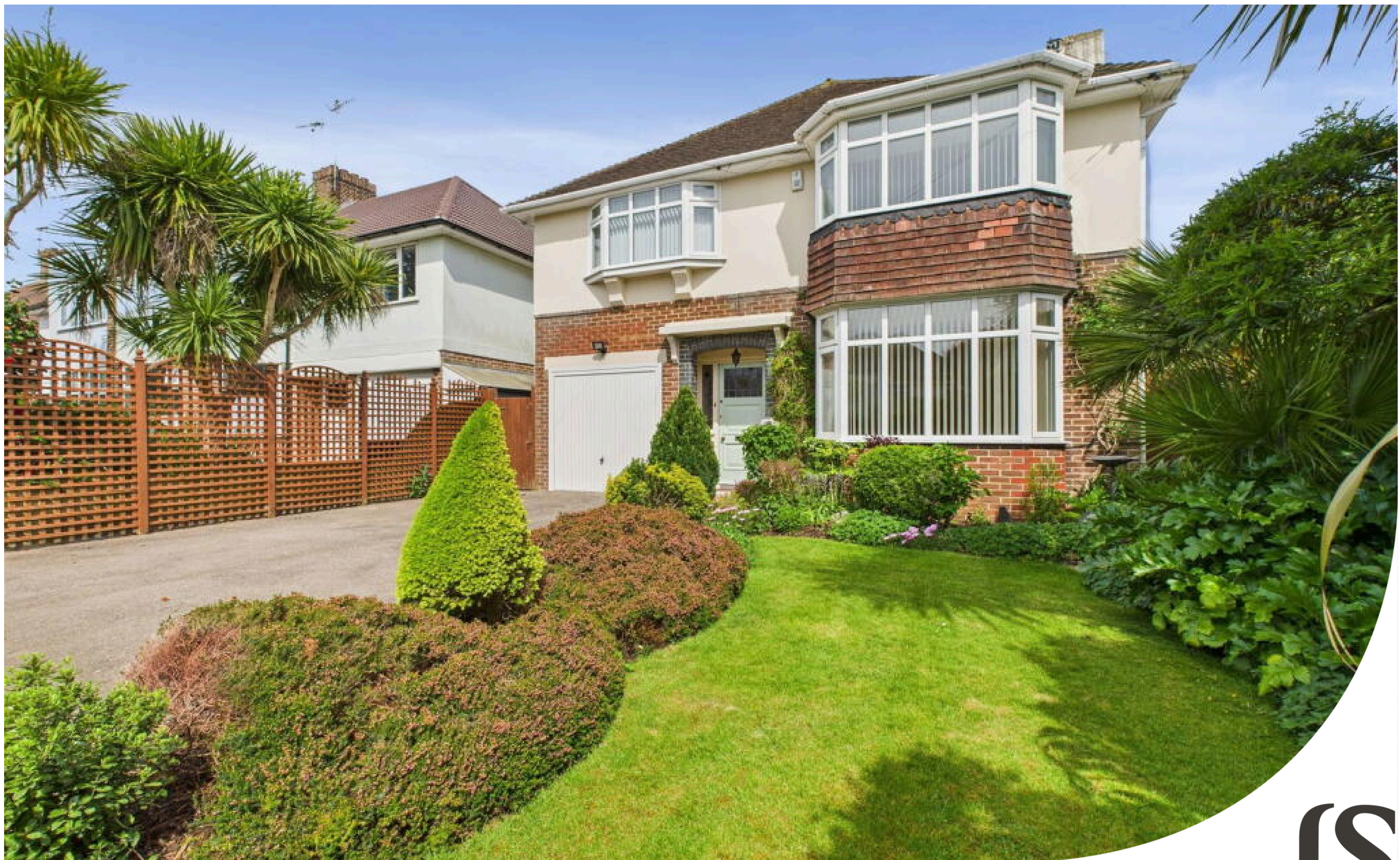
Trent Road, Goring-by-Sea, Worthing, BN11 5DA Offers Over £750,000