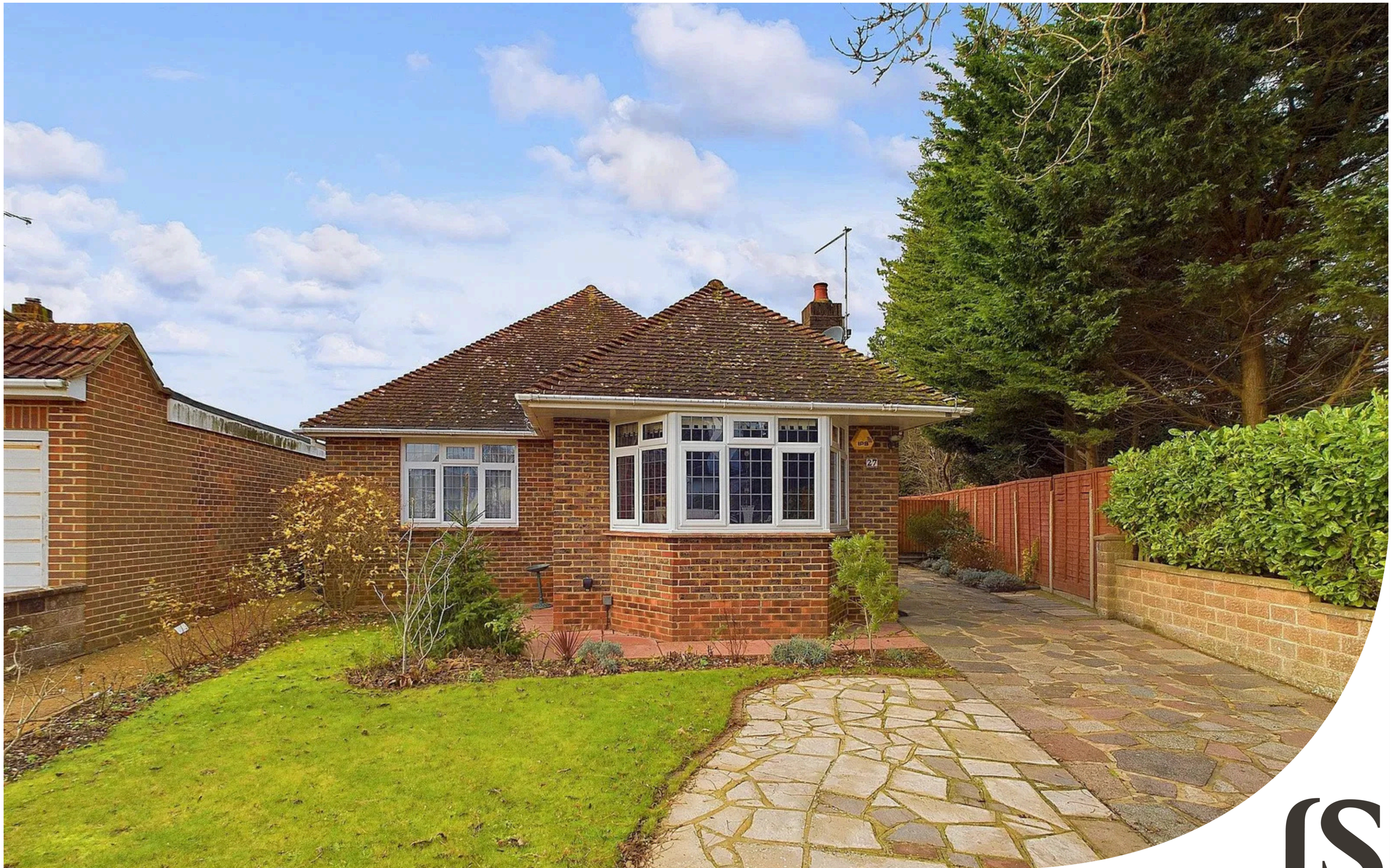
Hall Avenue | Worthing | BN14 9BD Guide Price £650,000