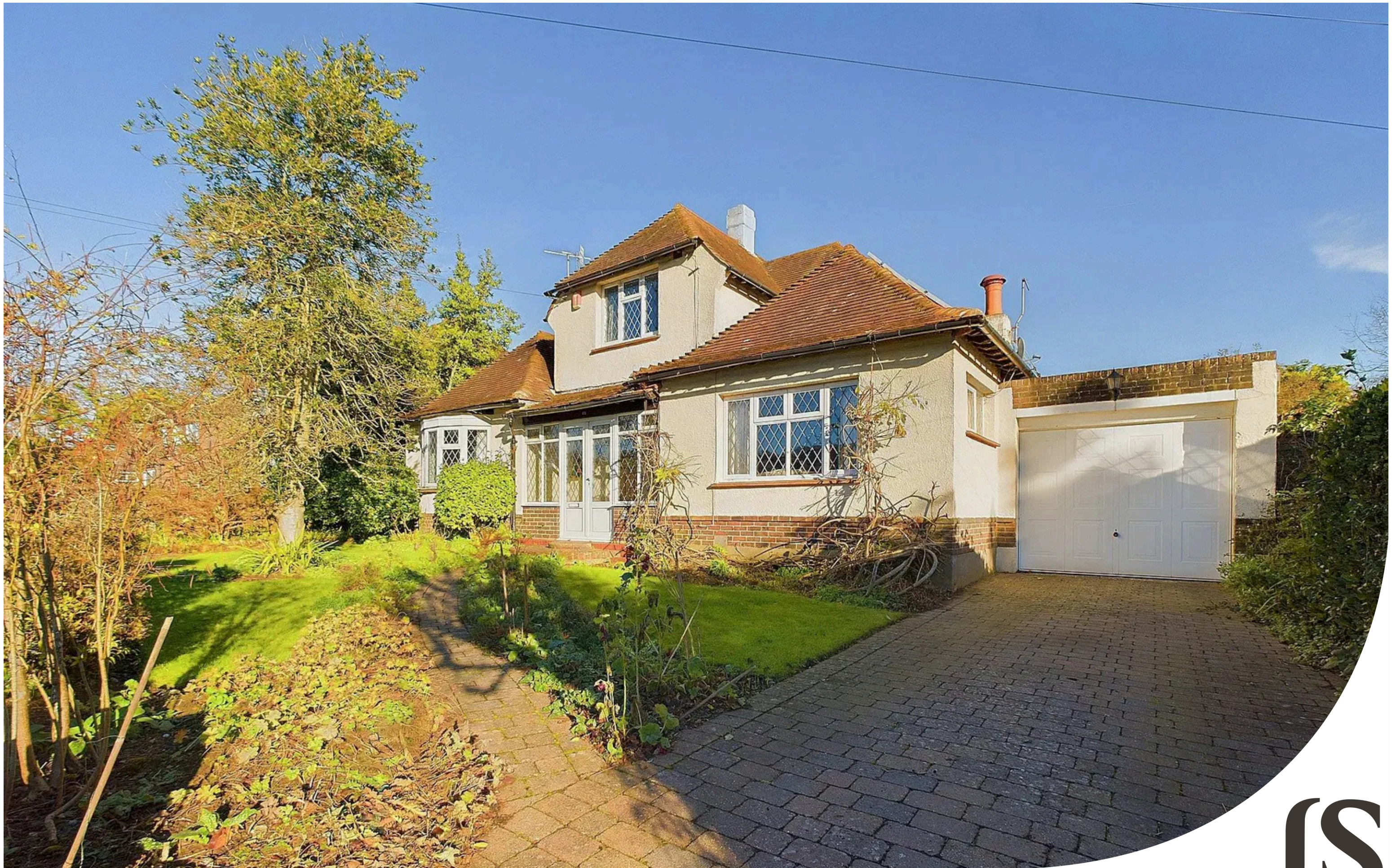
Limetree Avenue | Findon Valley | BN14 0DP Guide Price £700,000