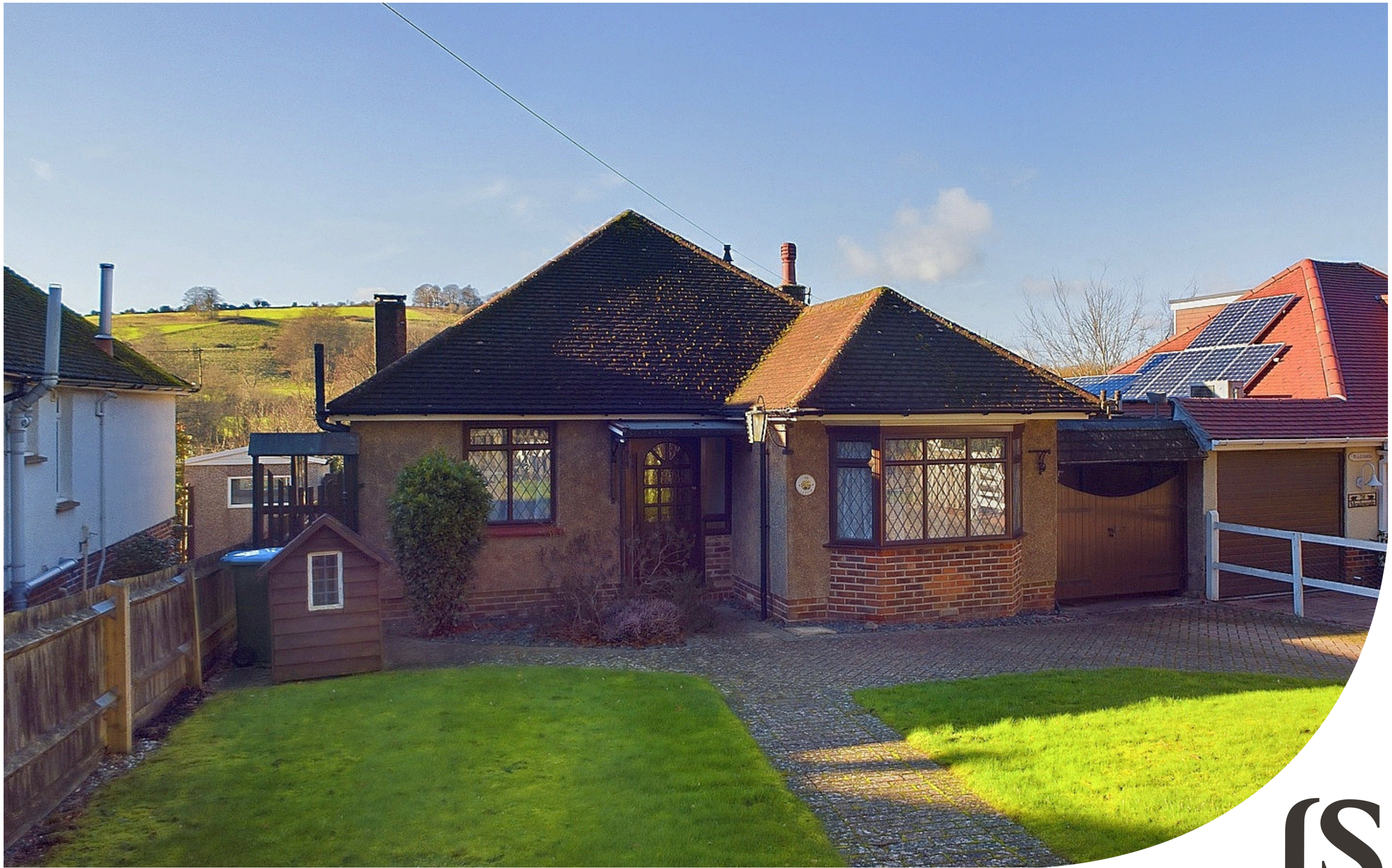
Cross Lane | Findon Village | BN14 0UB Offers Over £450,000