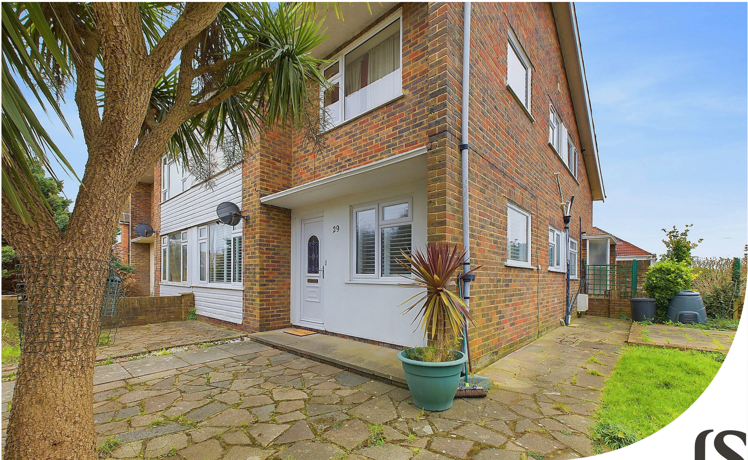
Alinora Avenue, Goring-by-Sea, Worthing, BN12 4NA Asking Price of £325,000