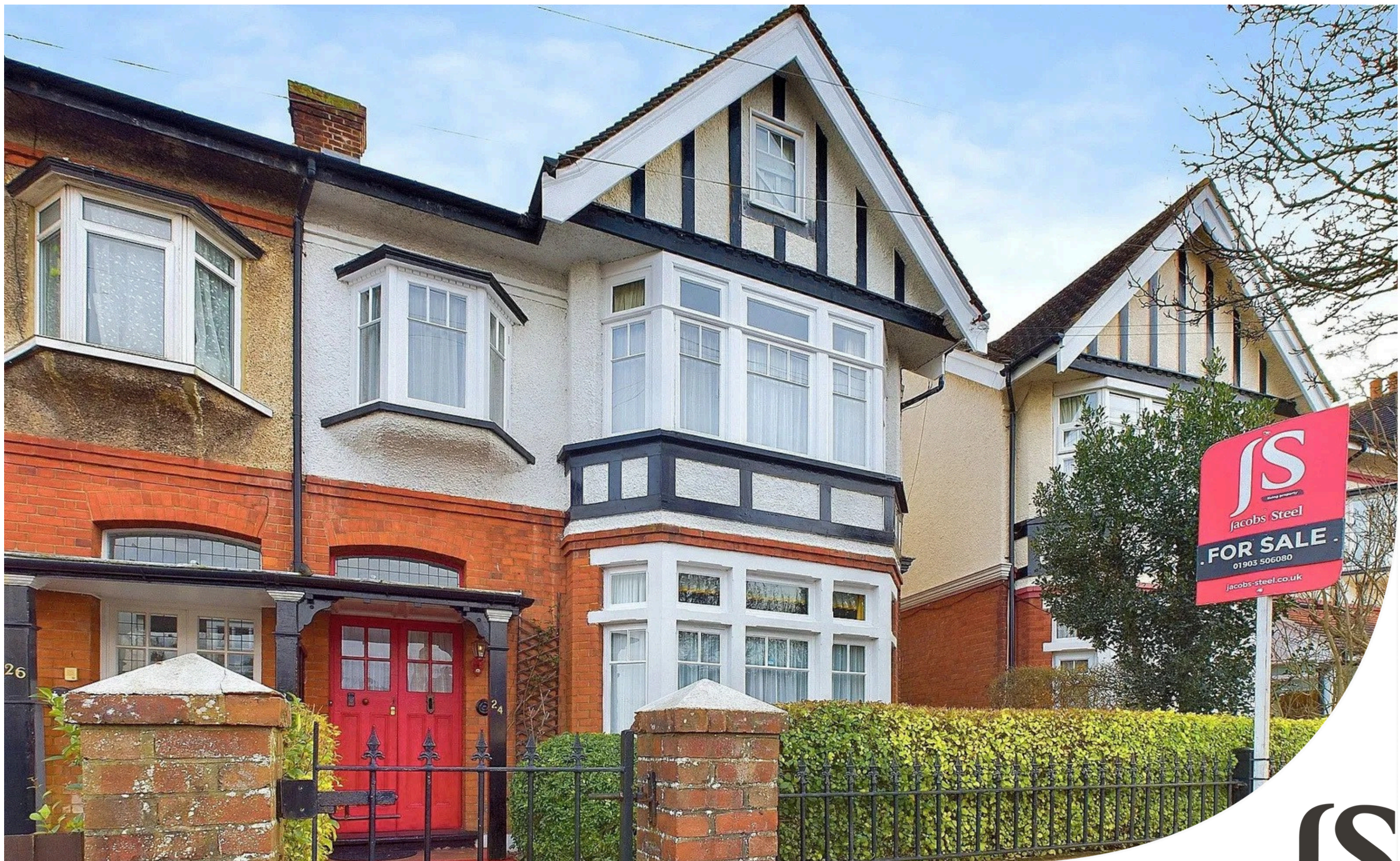
Reigate Road, Worthing, BN11 5NE Offers Over £750,000