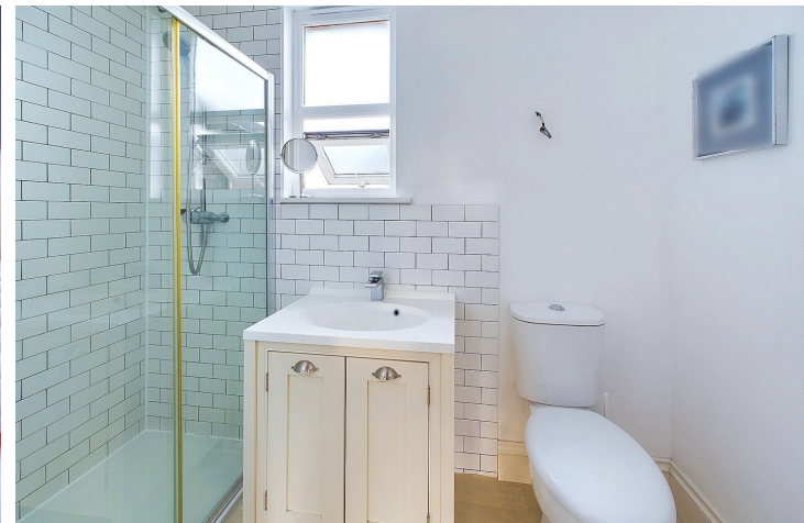
Property details: Gordon Road | Shoreham by Sea | BN43 6WF