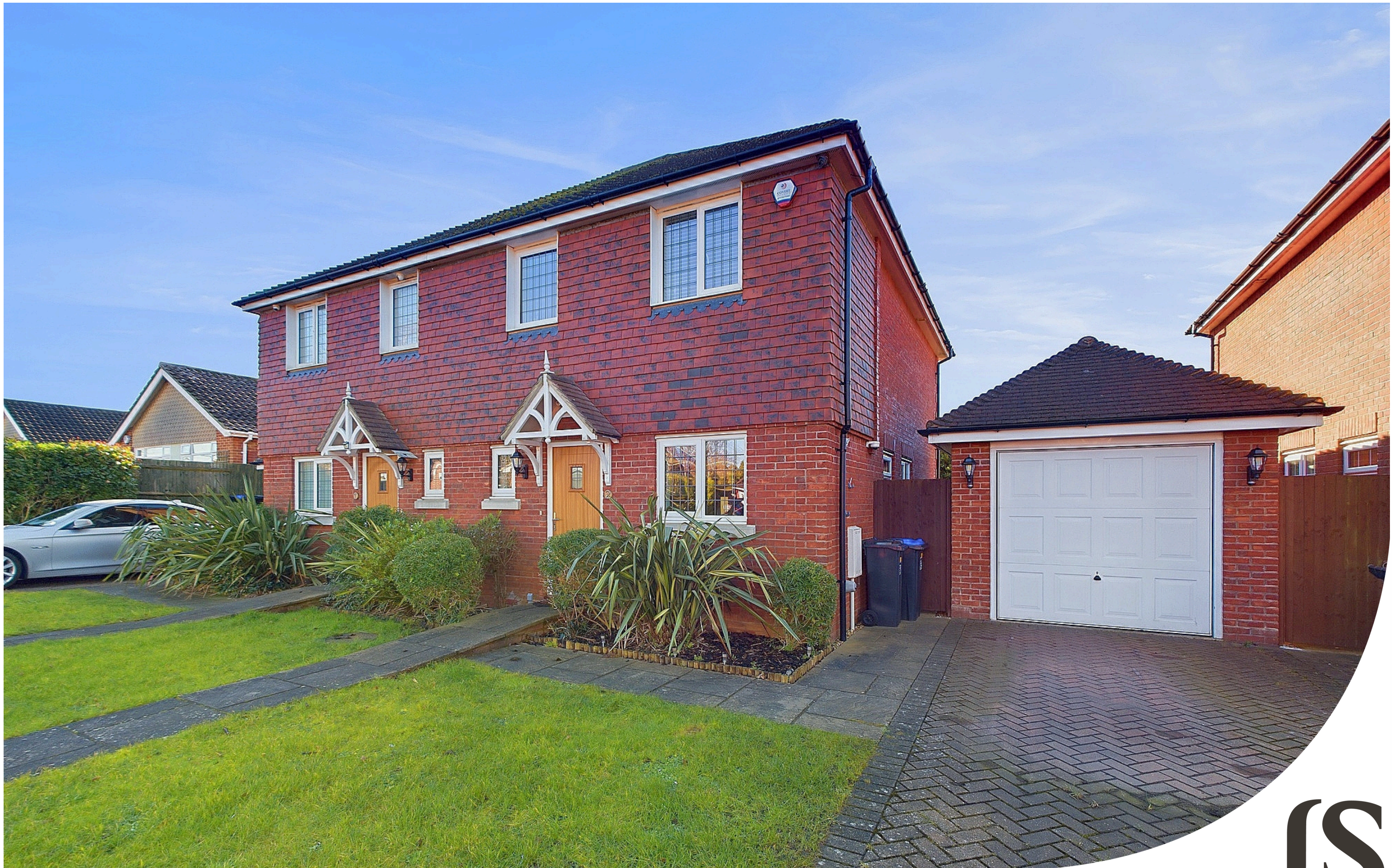
Lily Gardens | Salvington | BN13 2FB Guide Price £425,000