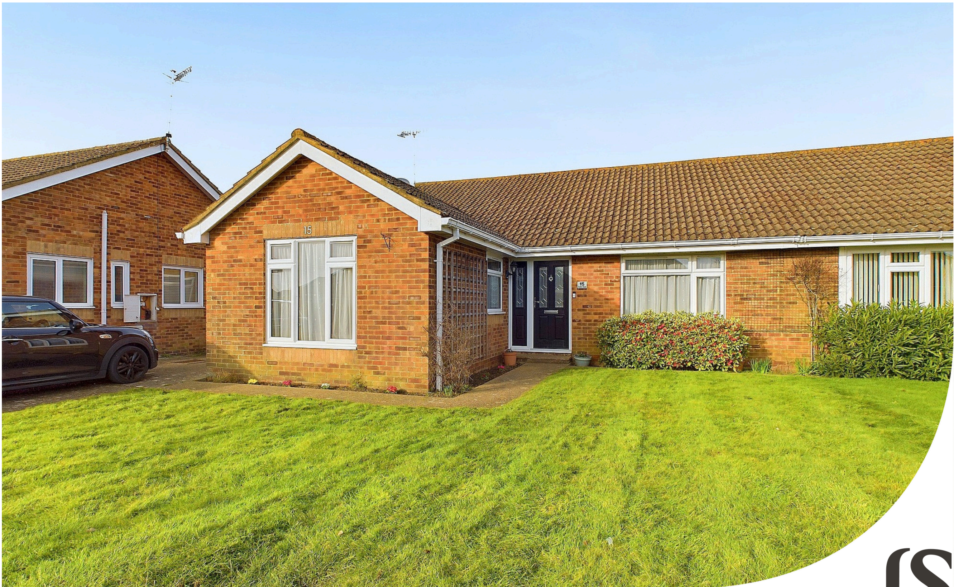
Castle Road, Worthing, BN13 1BS Asking Price Of £525,000