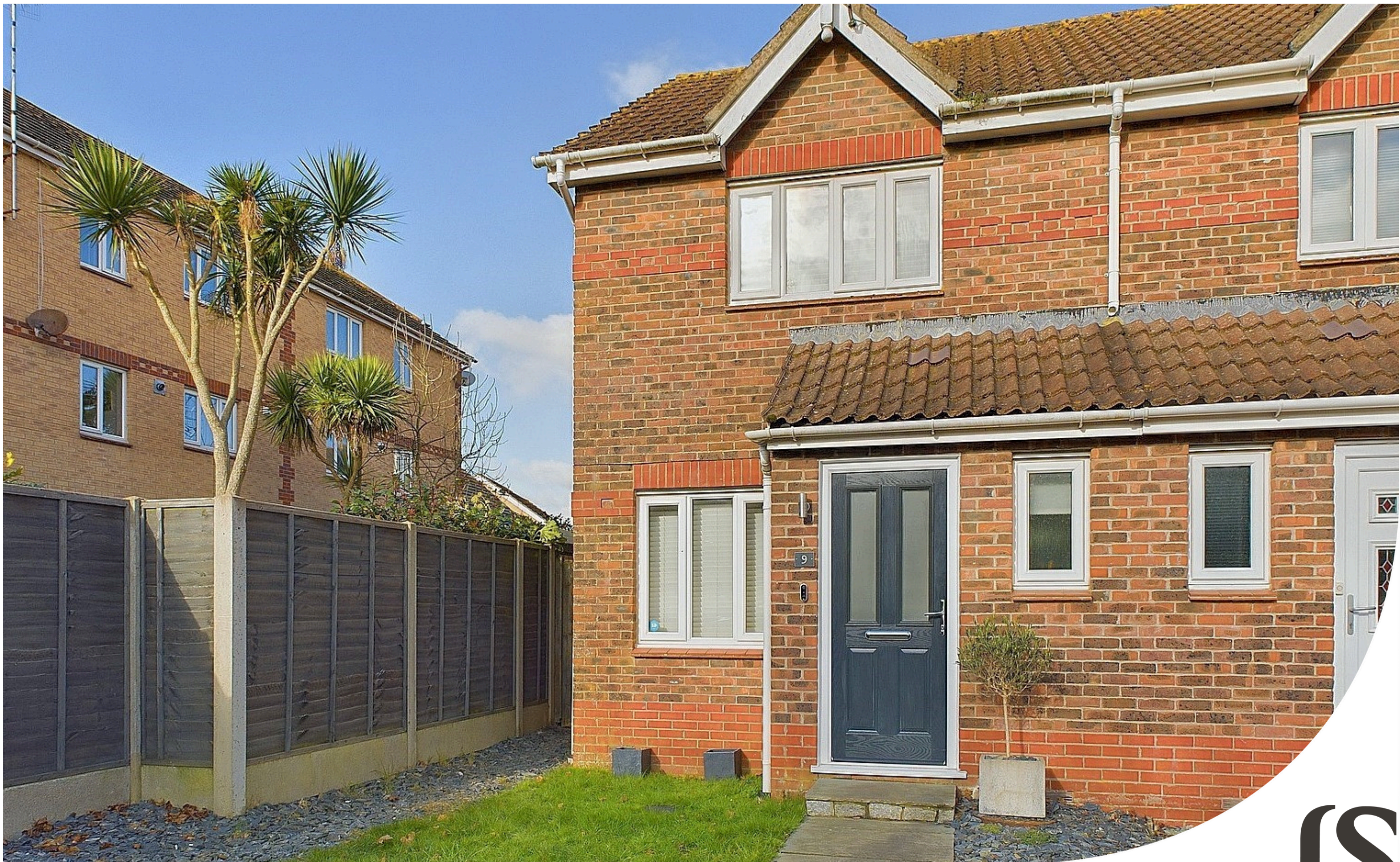
Essenhig Drive, Worthing, BN13 Guide Price £325,000