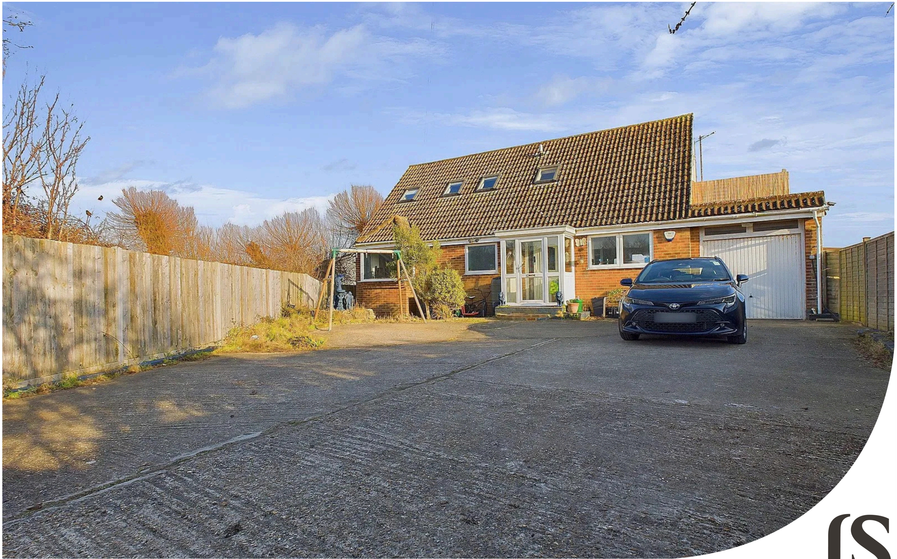
Old Salts farm Road | Lancing | BN15 8JD Asking Price Of £525,000