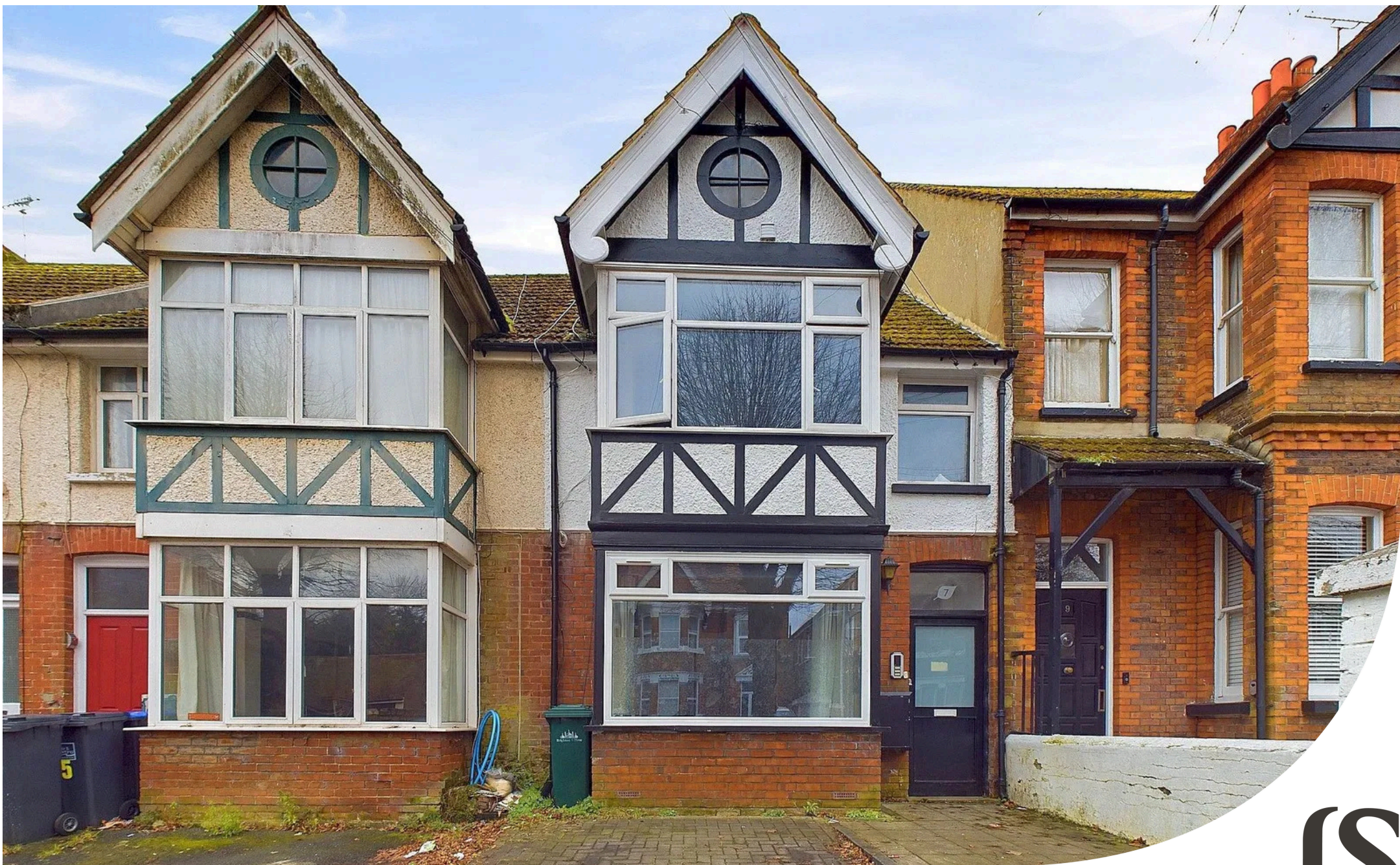
Pavilion Road | Worthing | BN14 7EE £285,000