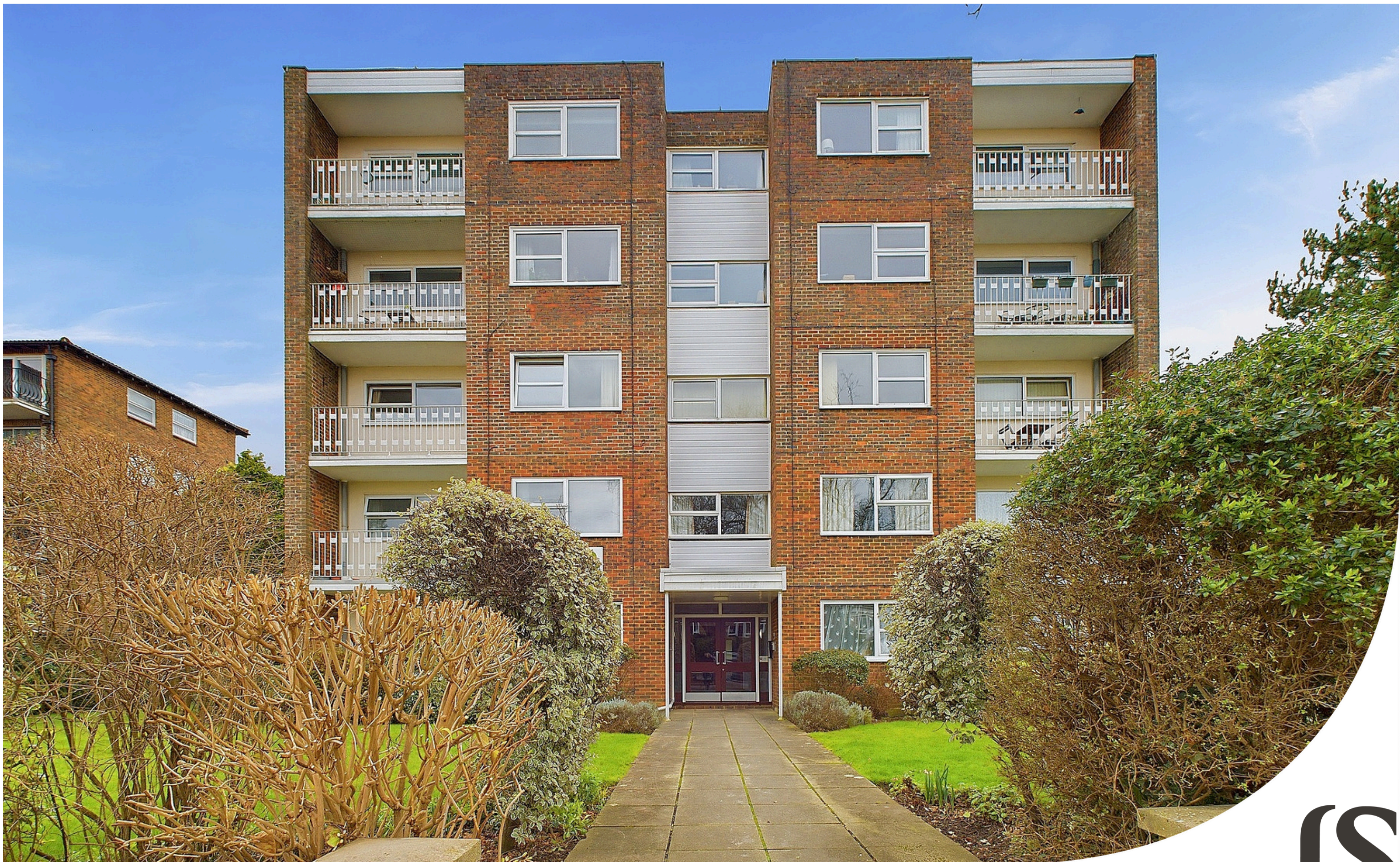
Flat , Wentworth Court, Downview Road, Worthing, BN11 4RJ Guide Price £225,000