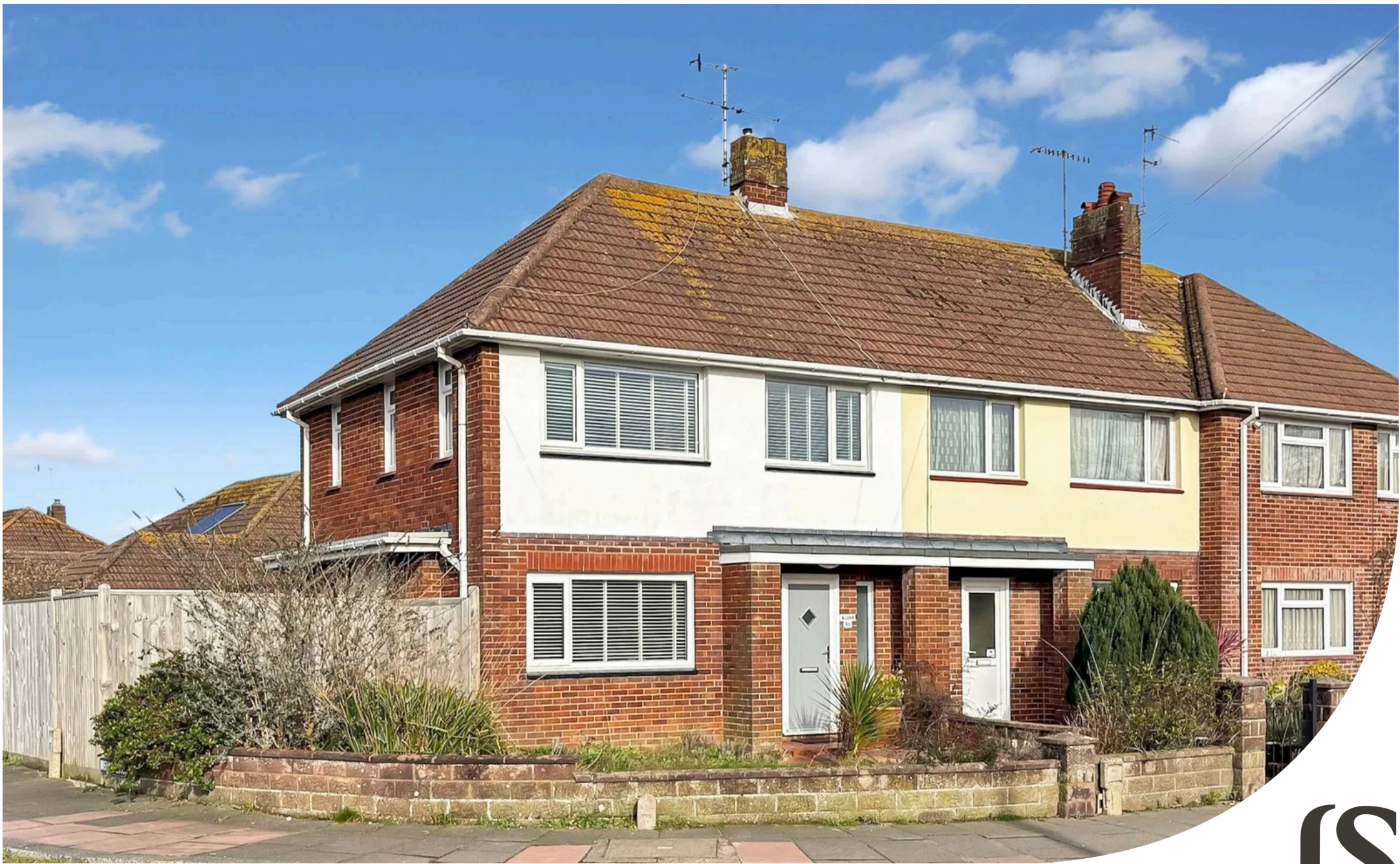
Wiston Avenue | Worthing | BN14 7PX £425,000