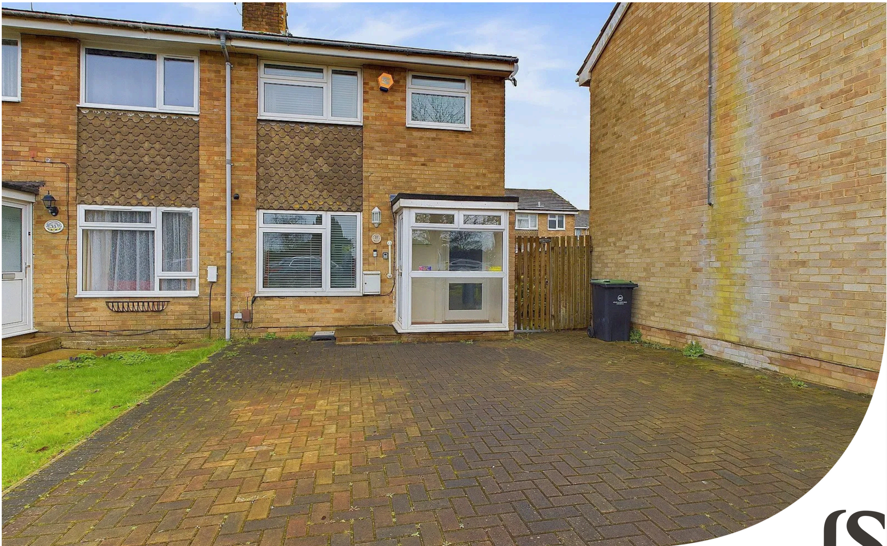
Coleridge Crescent, Goring-by-Sea, Worthing, BN12 6LU £325,000