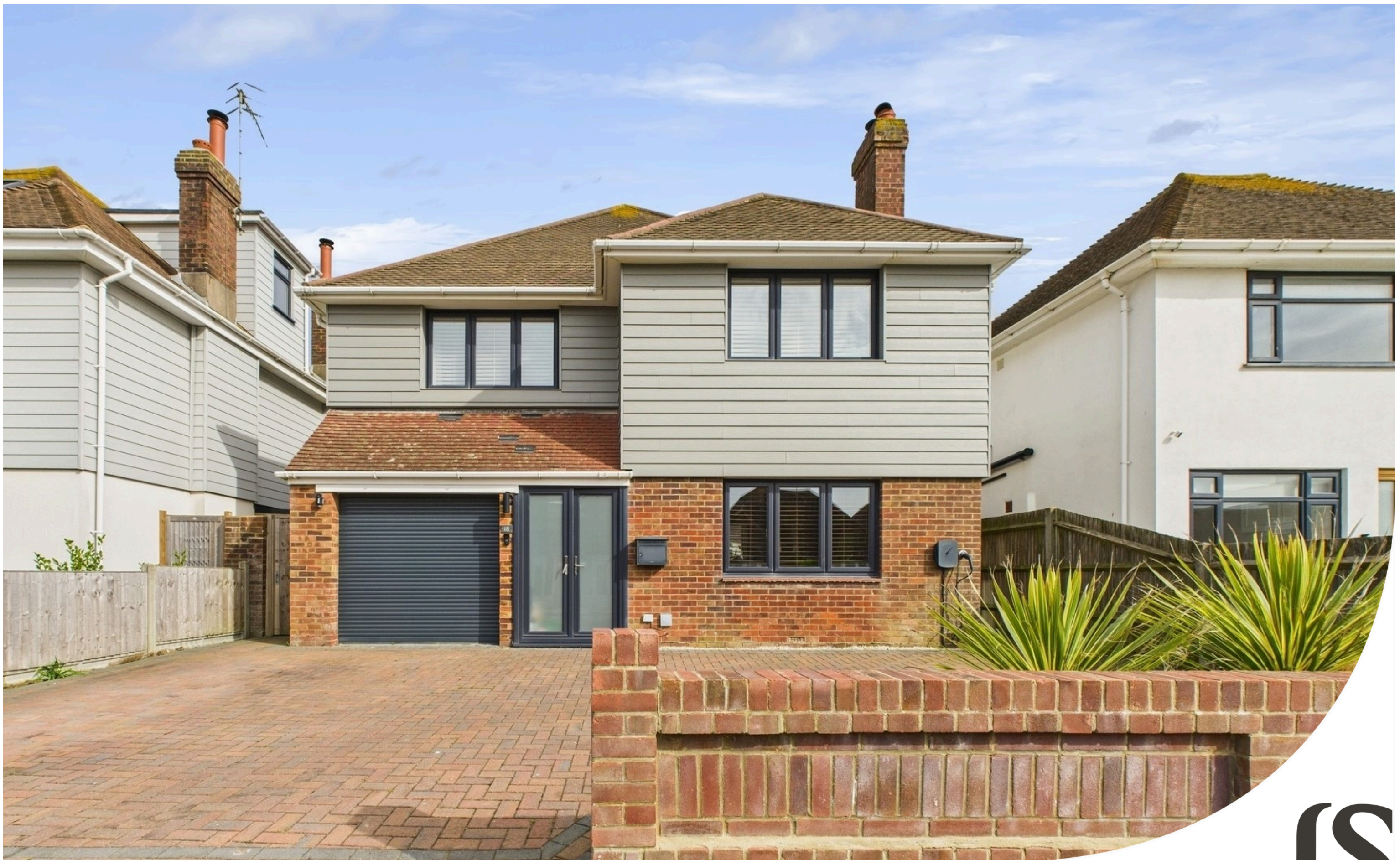
Bernard Road, Worthing, BN11 5EL Offers Over £800,000