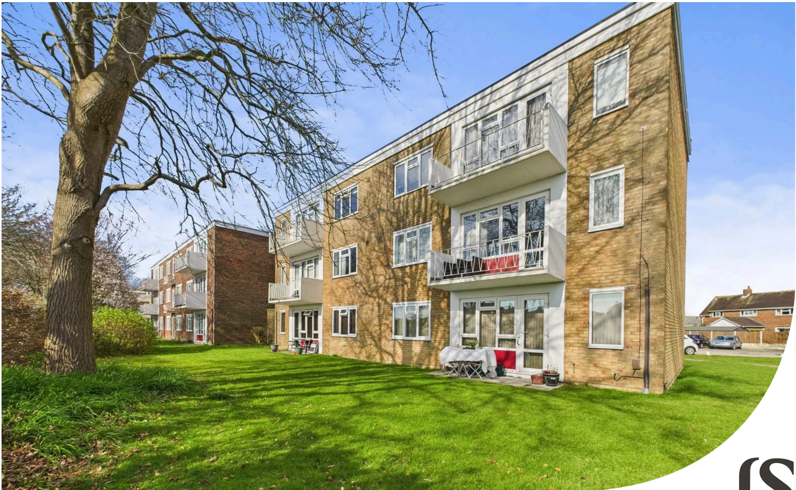
38 Sunningdale Court, Jupps Lane, Worthing, BN12 4TU Guide Price £245,000