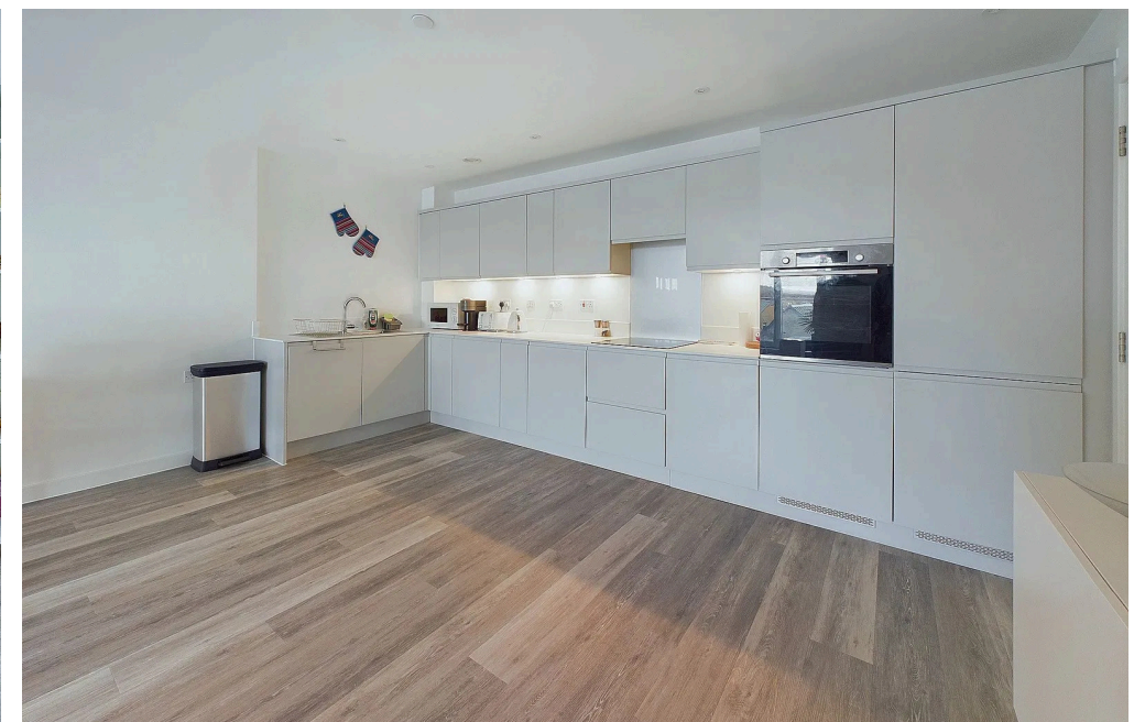
Property details: Ringed Plover Apartments, 25 Salt Marsh Road | Shoreham by Sea | BN43 5QQ