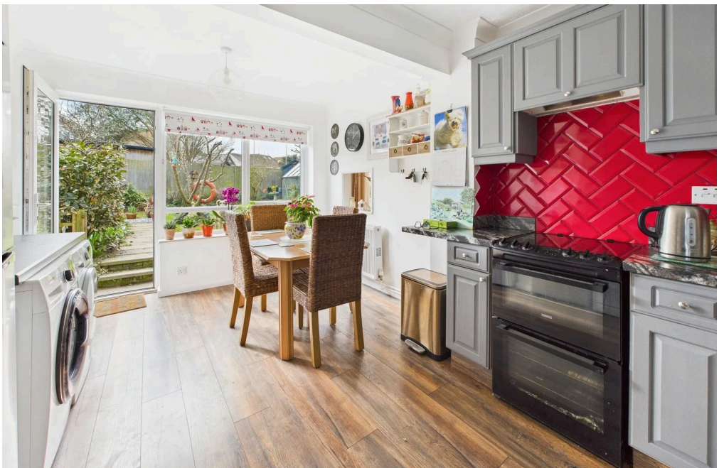
Property details: Beach Green | Shoreham by Sea | BN43 5YE