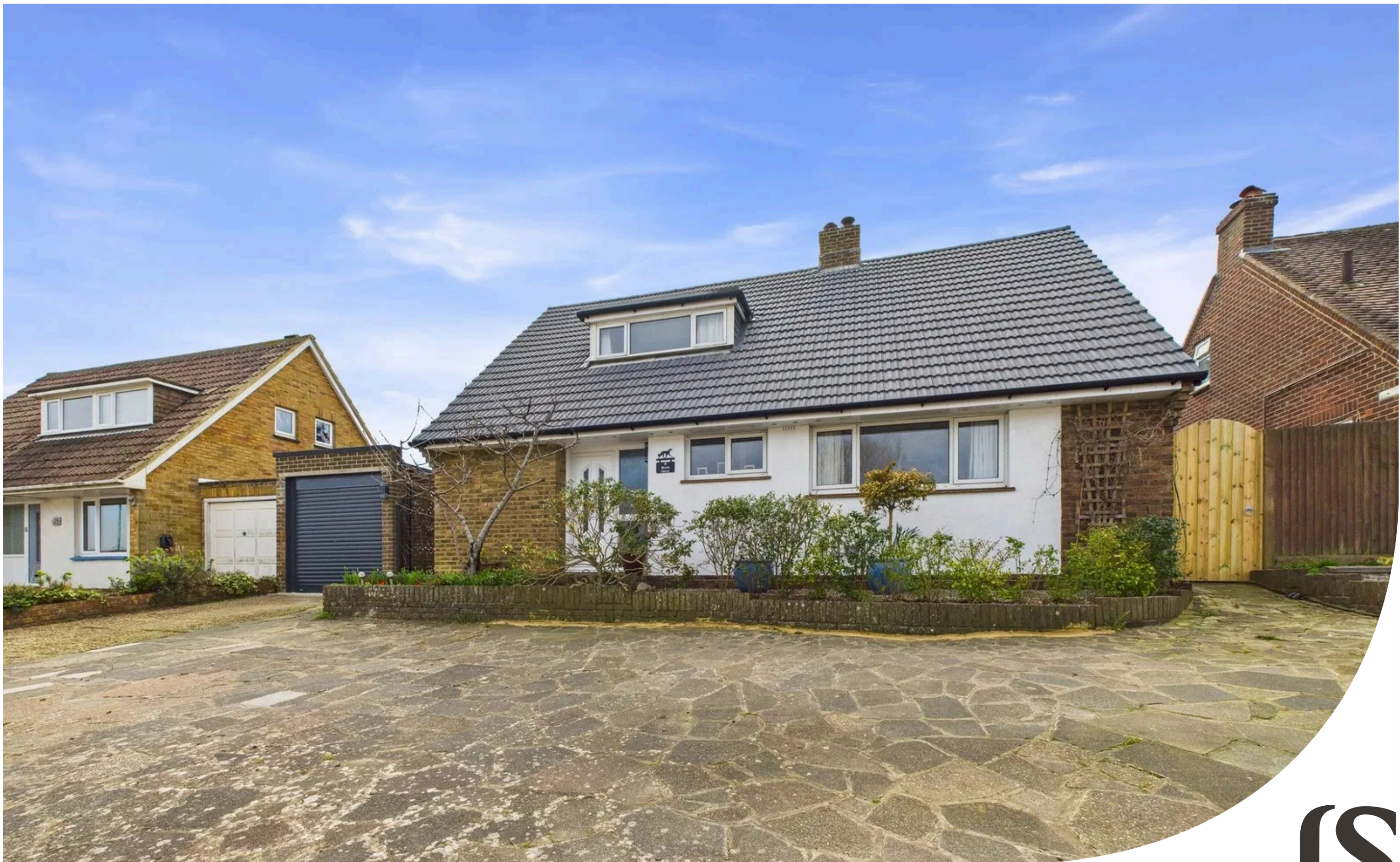
Beach Green | Shoreham by Sea | BN43 5YE £825,000