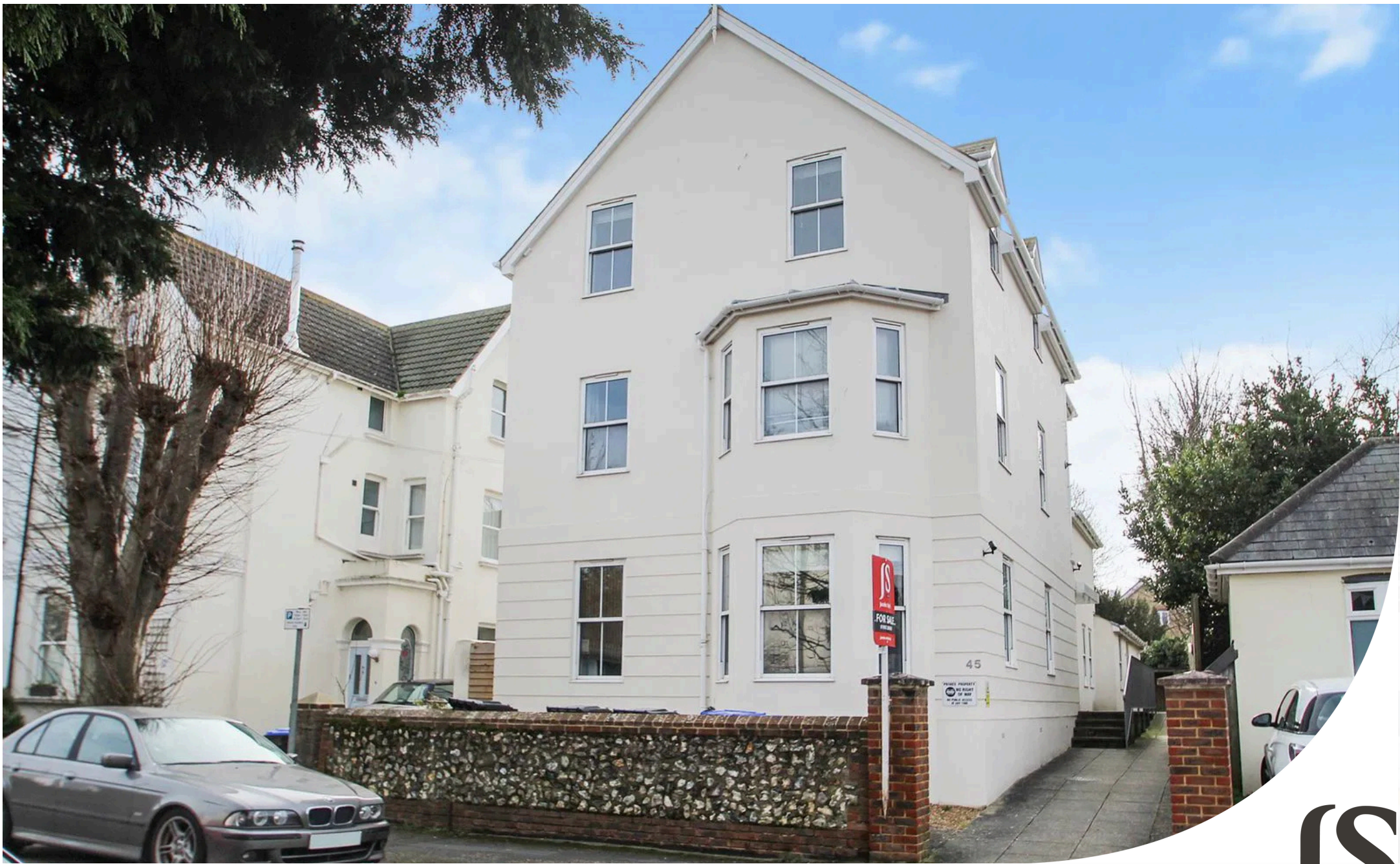
Wenban Road | Worthing | BN11 1HY Offers Over £220,000