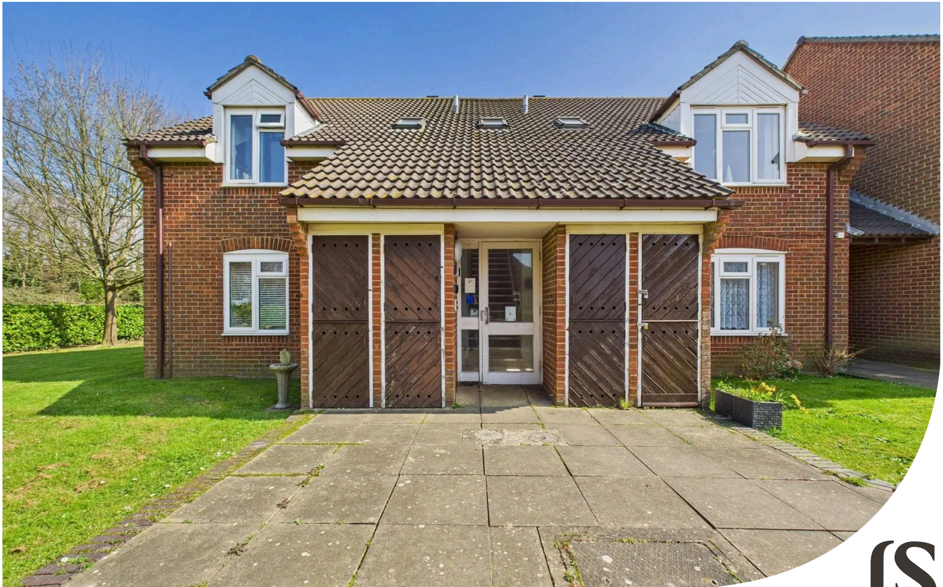
Courtfields | Elm Grove | Lancing | BN15 8PA Asking Price Of Offers Over £140,000