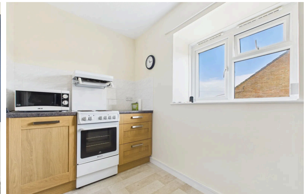
Property details: Courtfields, Elm Grove