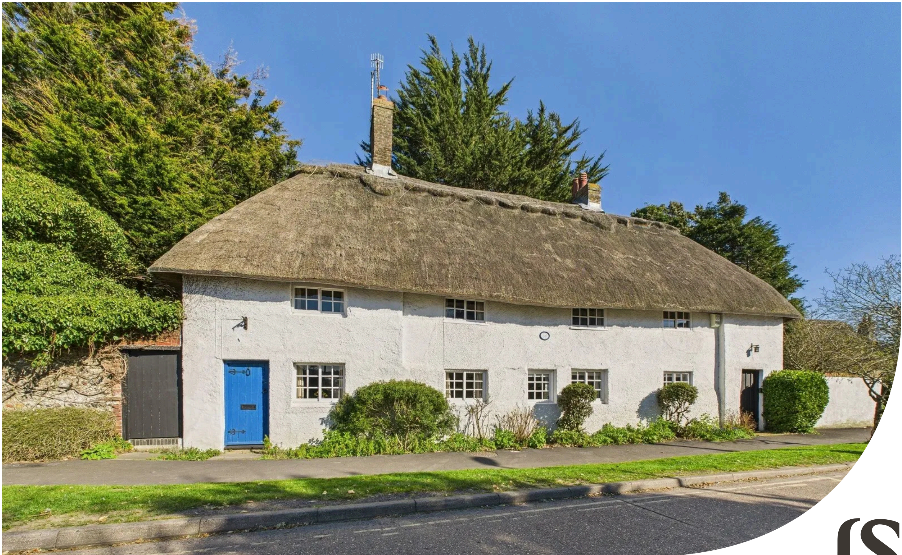
Connaught Avenue | Shoreham by Sea | BN43 5WP Guide Price £650,000