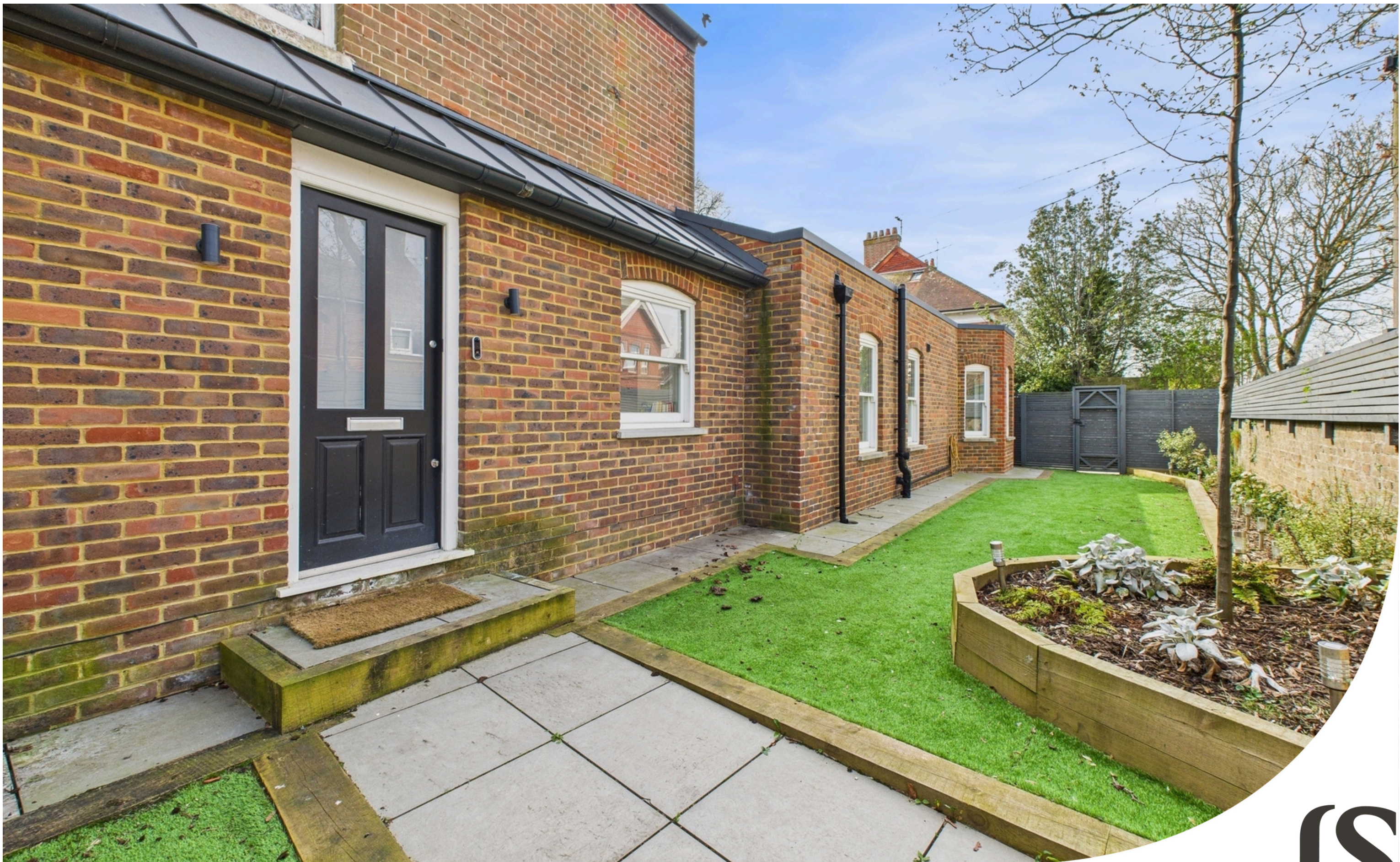
Rugby Road, Worthing, BN11 4PT Guide Price £350,000