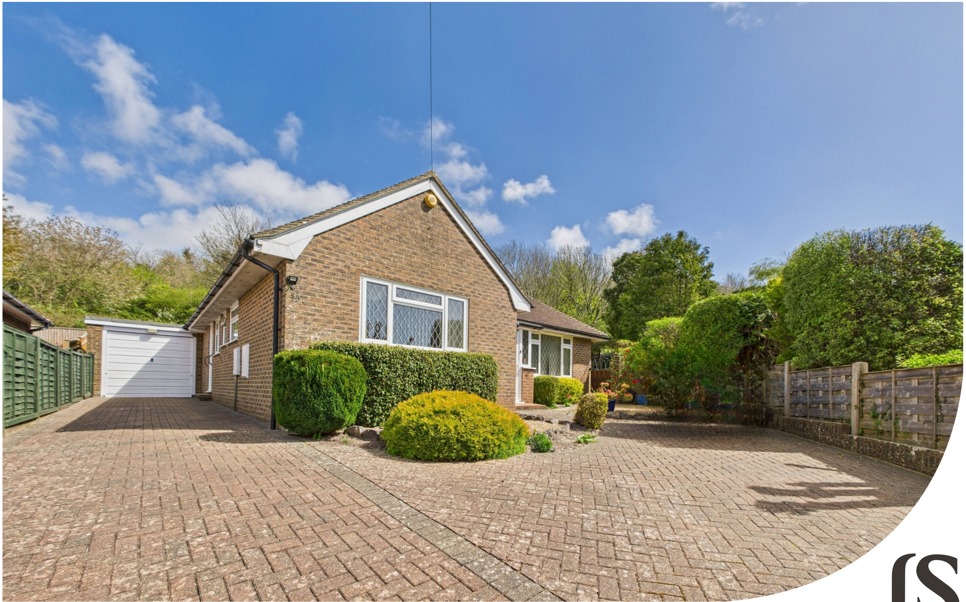
The Heights | Findon Valley | BN14 0AW Guide price £550,000