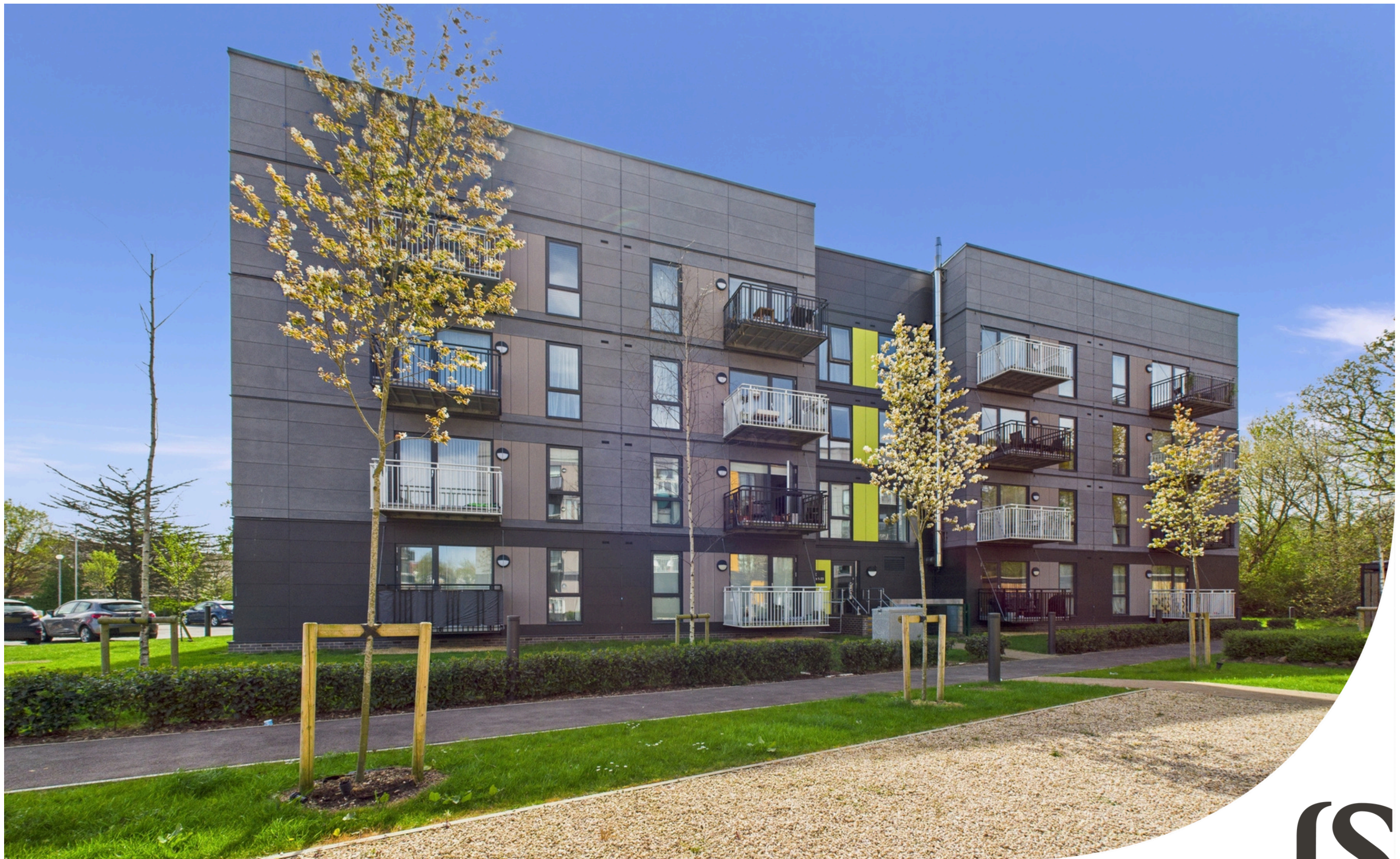
Winslar, 1 Ladybower Road, Worthing, BN13 3NU Offers Over £270,000