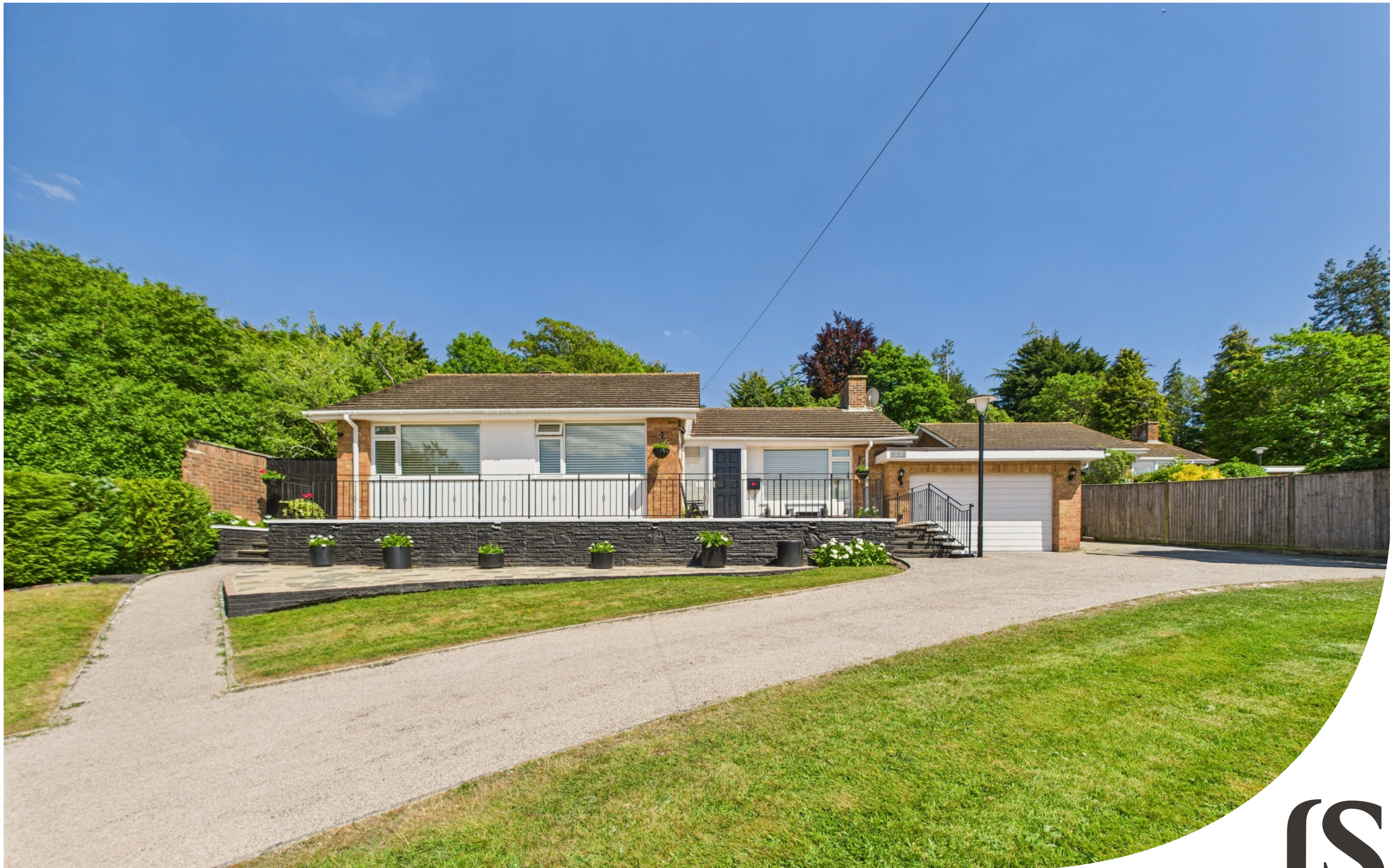
The Heights | Findon Valley | BN14 0AJ Guide price £800,000