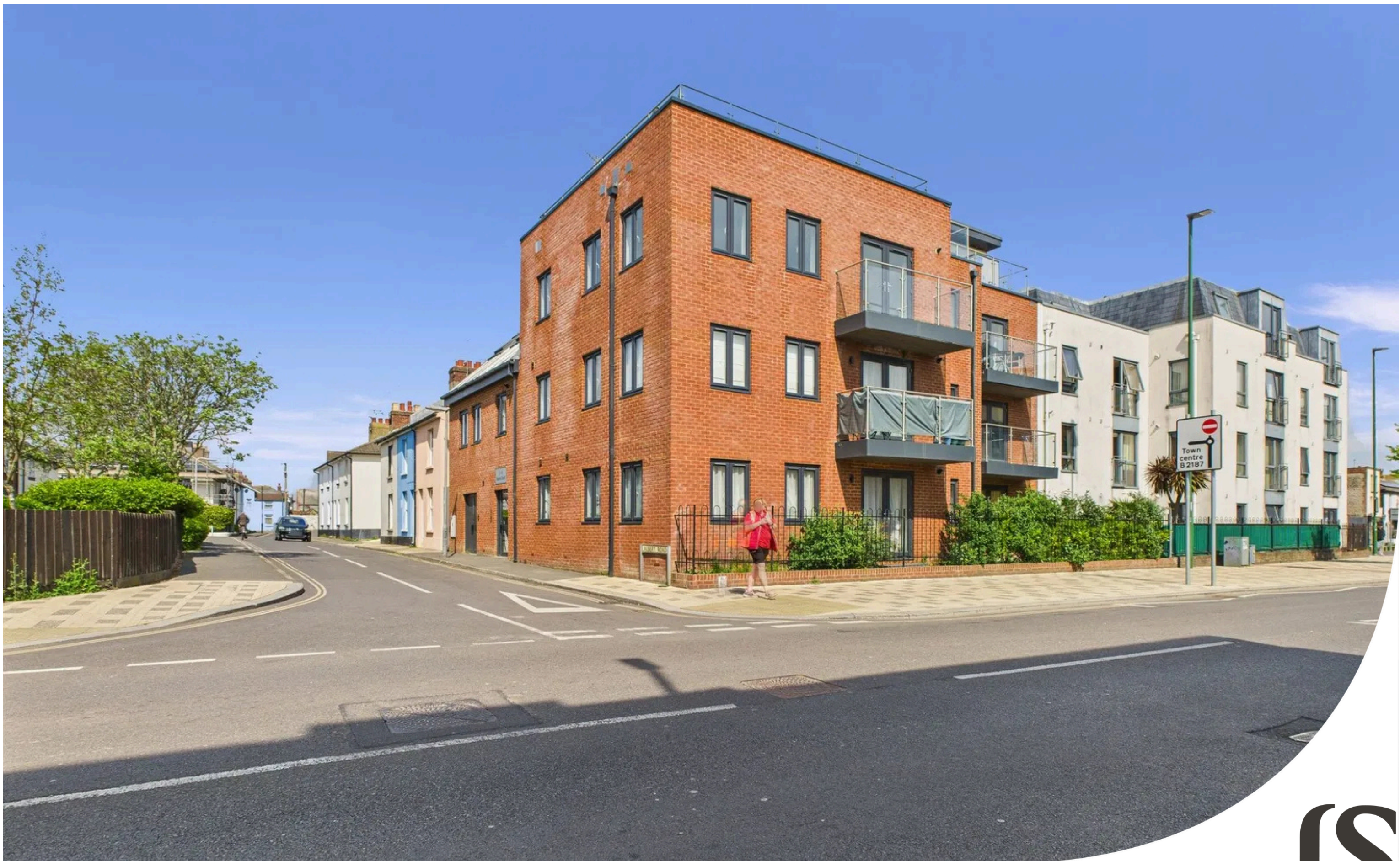
7 Saxon Court, Albert Road, Littlehampton , BN17 7TN Asking Price of £165,000