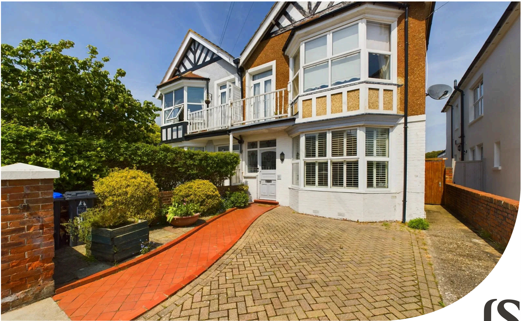
Church Walk | Worthing | BN11 2LT £265,000