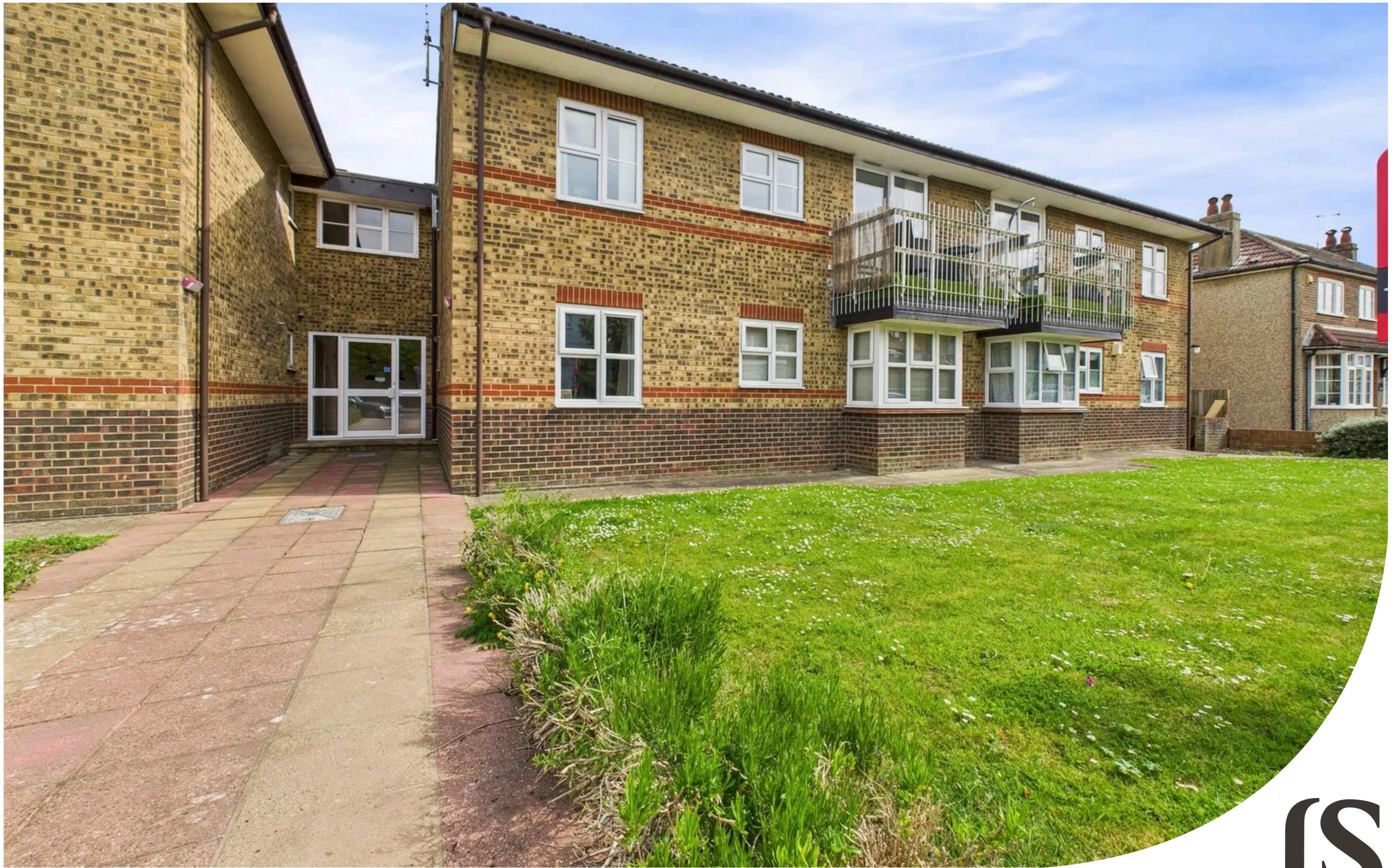
Beach Grove, Old Salts farm Road, Lancing, BN15 8PZ Offers in the Region of £160,000