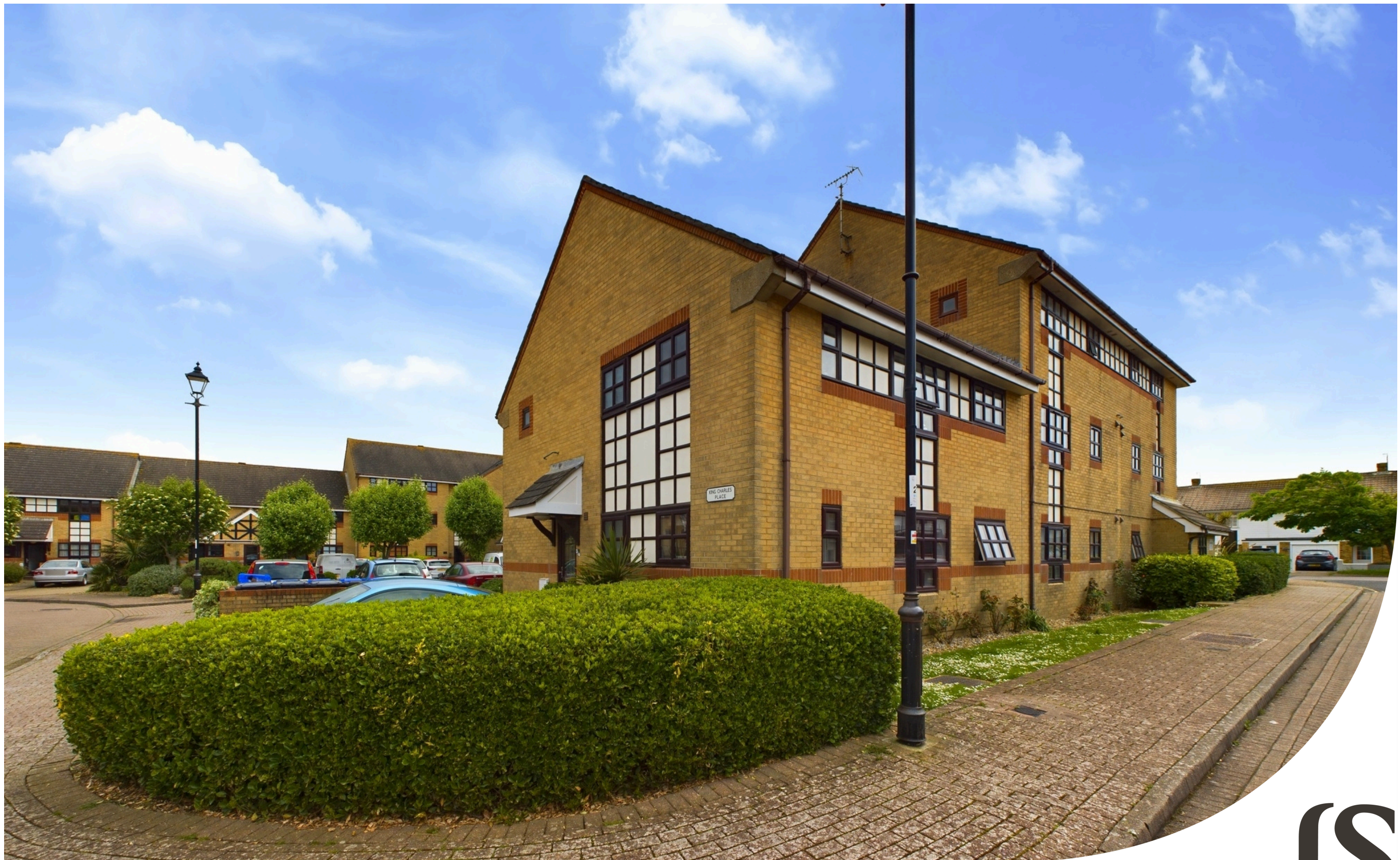
King Charles Place | Shoreham by Sea | BN43 5JH Offers Over £230,000