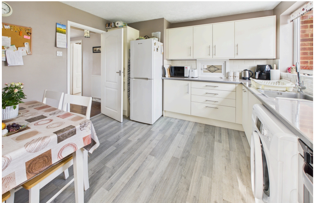
Property details: Thyme Close | Shoreham by Sea | BN43 6JJ