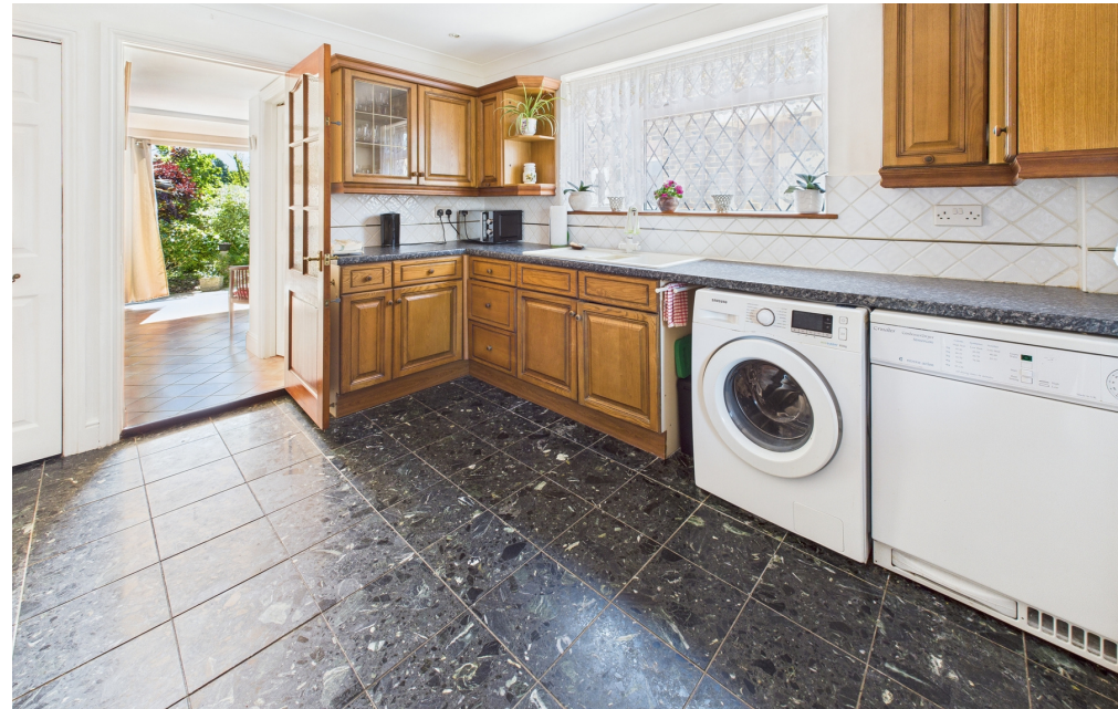
Property details: Orchard Close | Southwick | BN42 4NJ