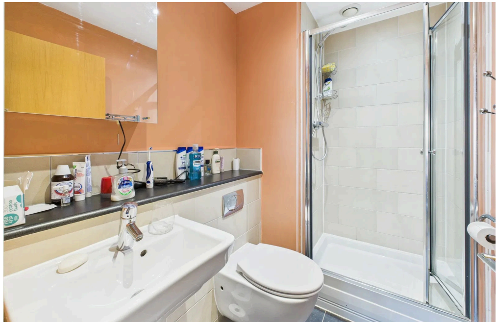
Property details: Linemans View | Shoreham by Sea | BN43 5EH