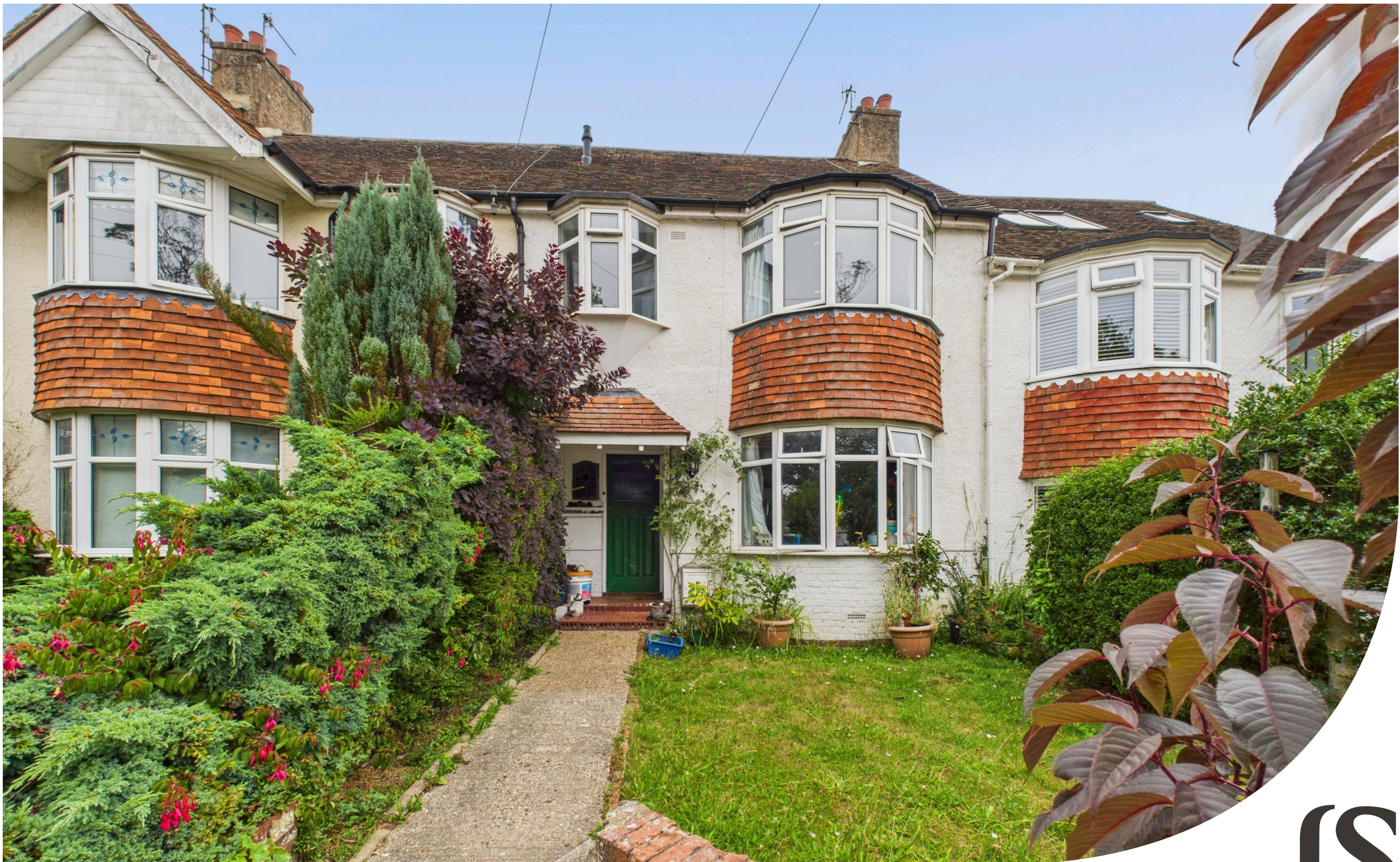
Parkside | Shoreham by Sea | BN43 6HA Guide Price £625,000