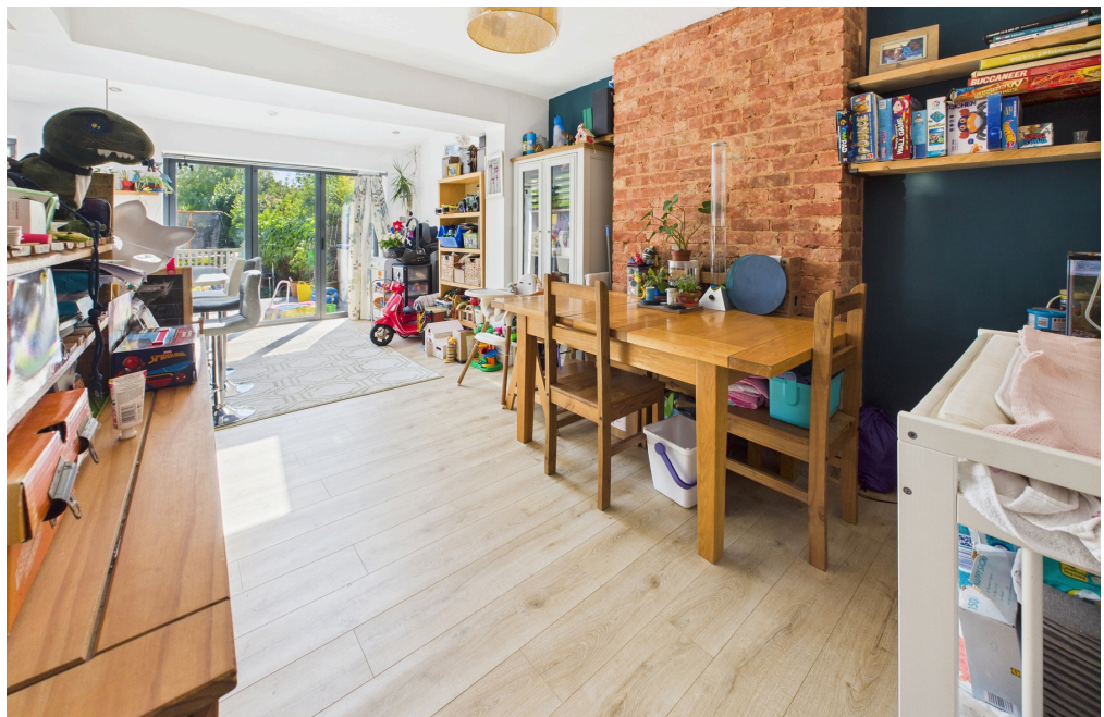
Property details: Parkside | Shoreham by Sea | BN43 6HA