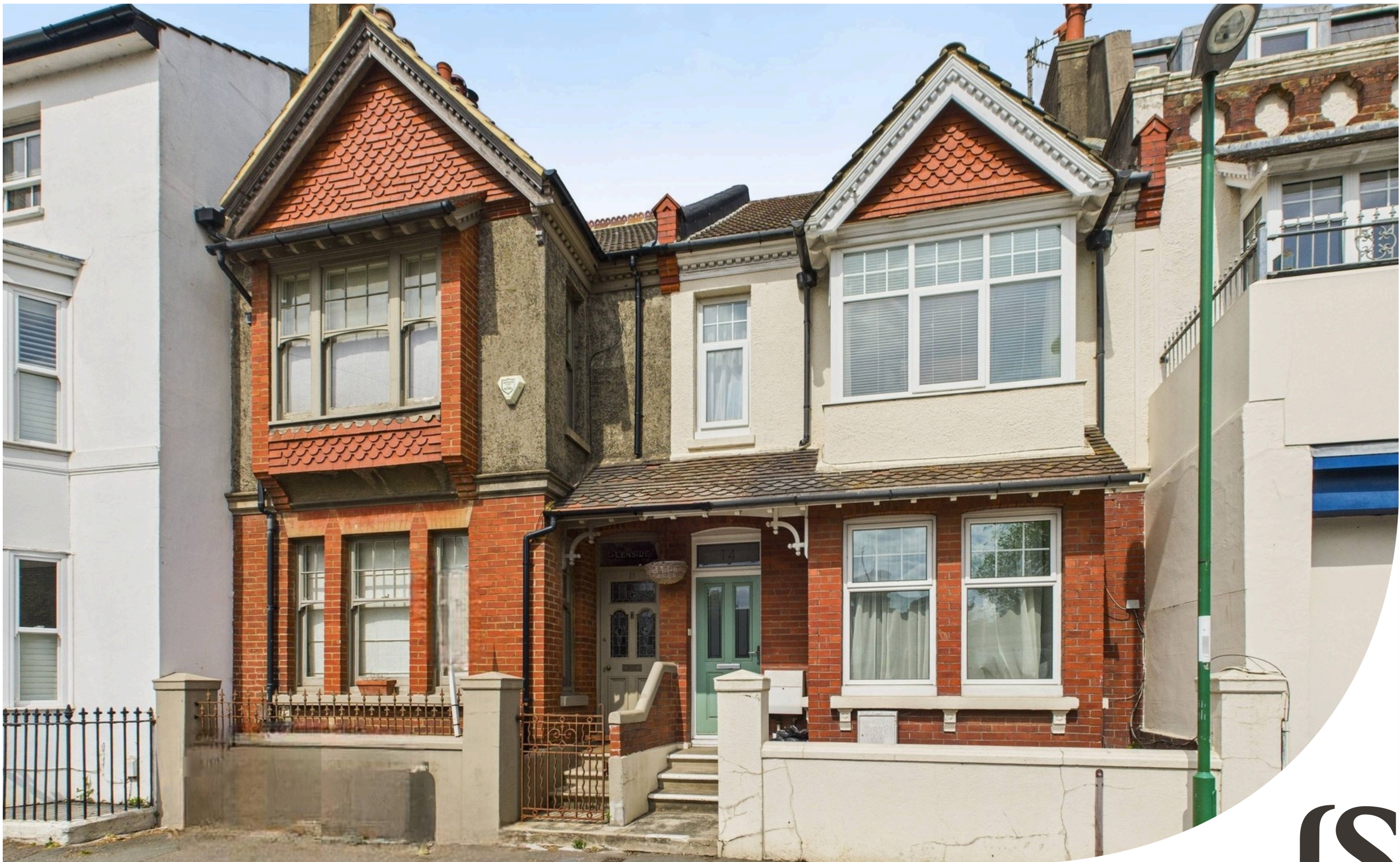
GFF Western Road | Shoreham by Sea | BN43 5WD £325,000