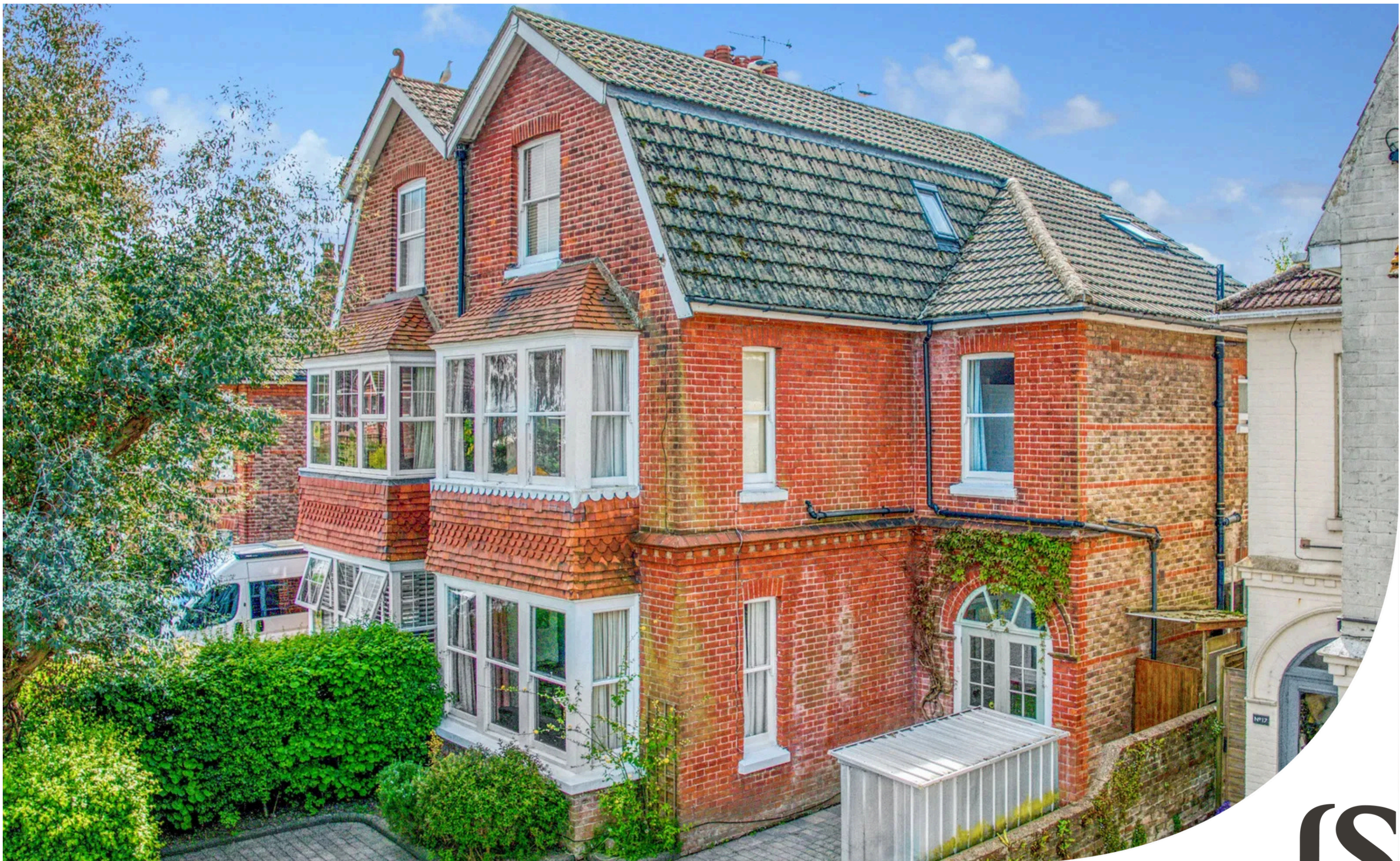
Valencia Road, Worthing, BN11 4QD Offers Over £850,000