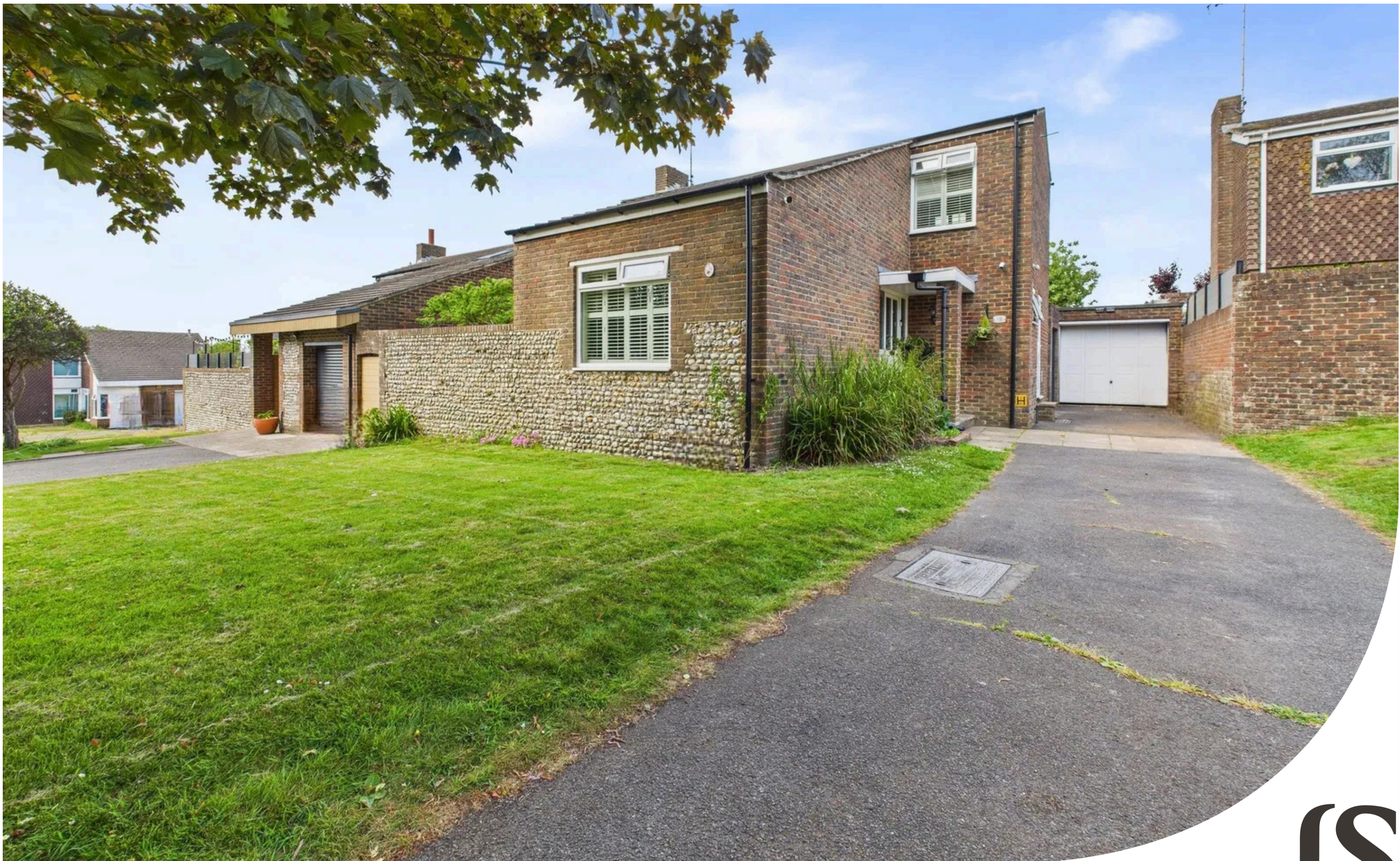
Lesser Foxholes | Shoreham by Sea | BN43 5NT Guide Price £700,000