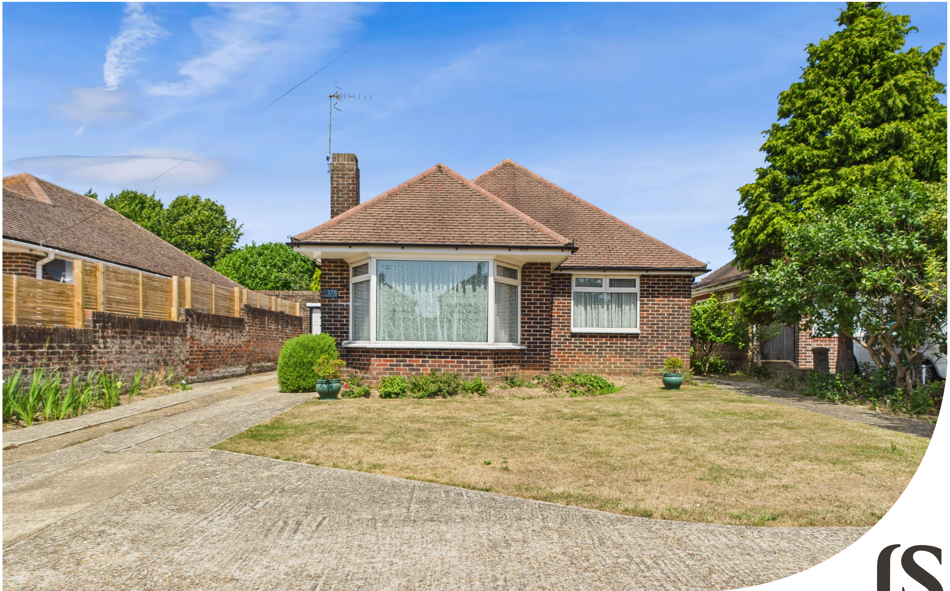
Littlehampton Road | Worthing | BN13 1QY Guide Price £475,000