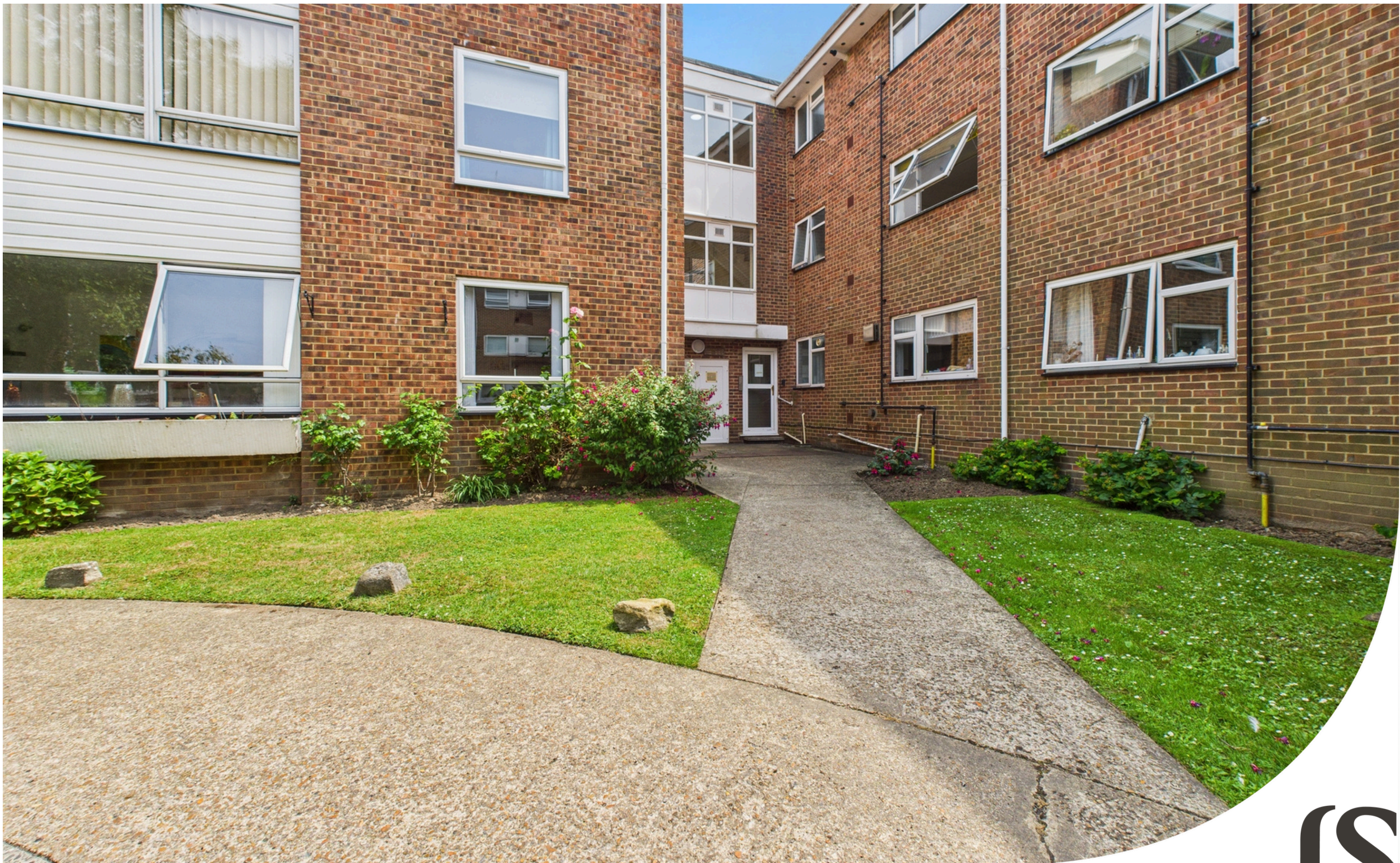
High Pines, St. Botolphs Road, Worthing, BN11 4JU Asking Price Of £175,000