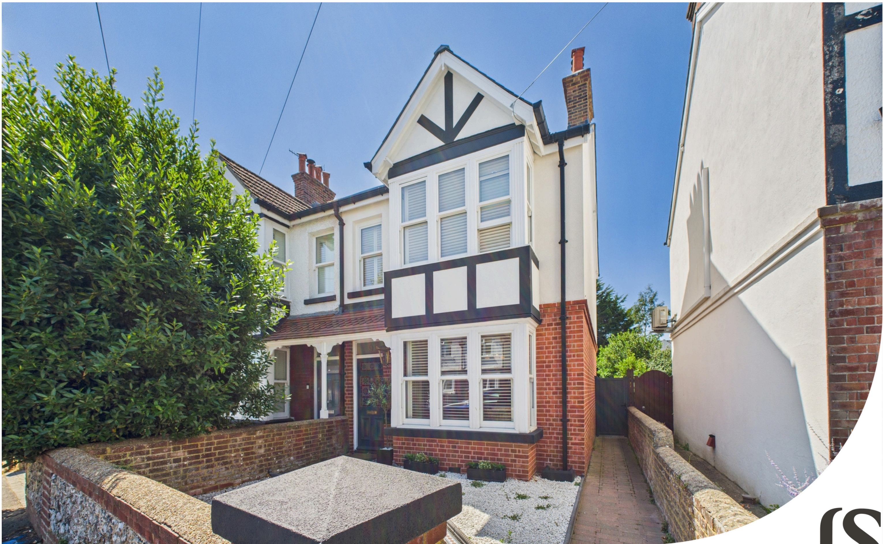
Highfield Road, Worthing, BN13 1PX Guide Price £650,000