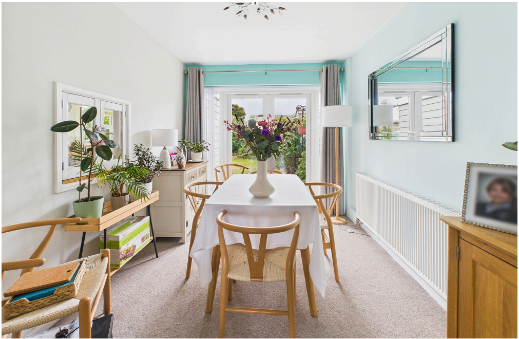
Property details: St Giles Close | Shoreham by Sea | BN43 6GR