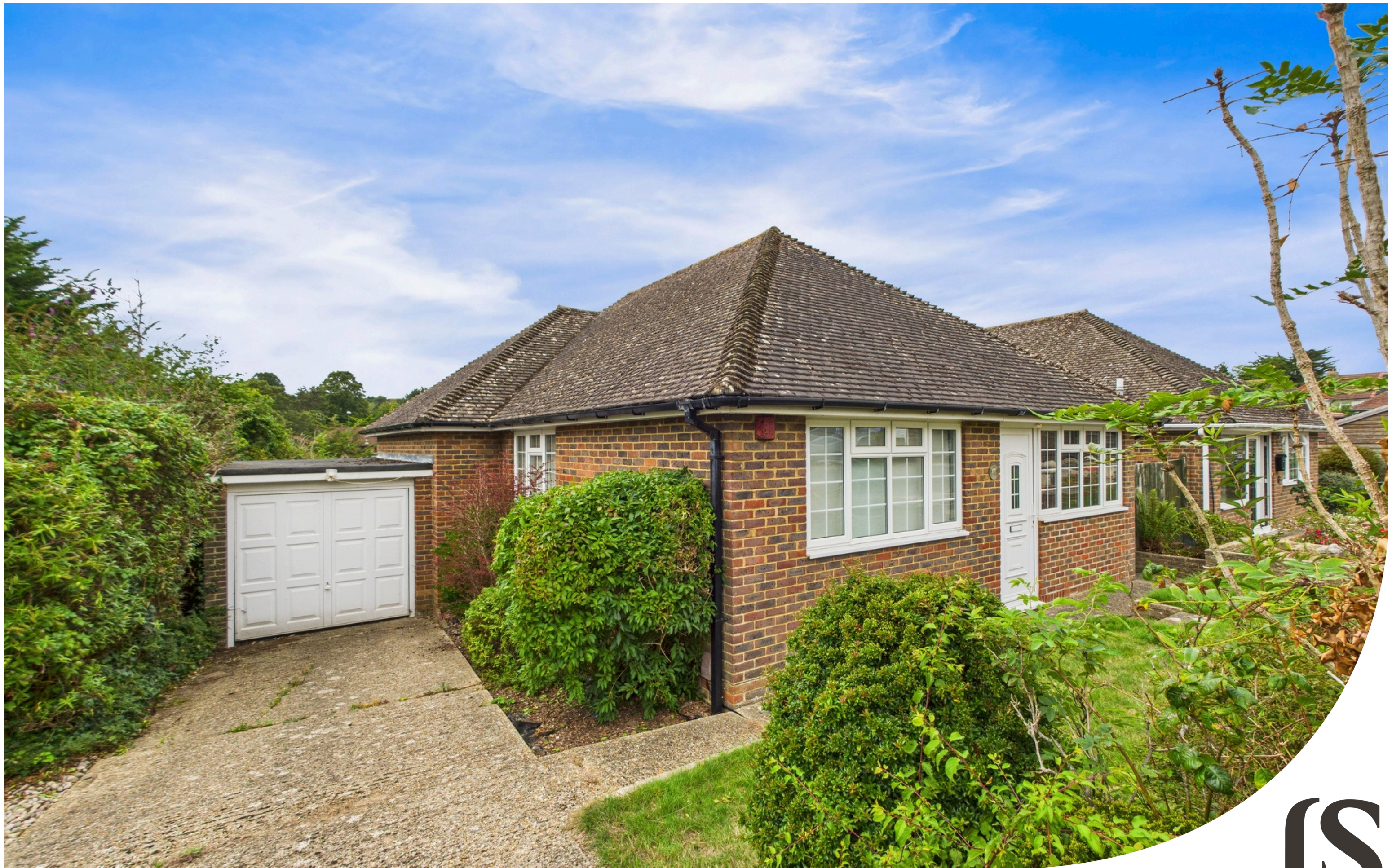
Husrton Close | Worthing | BN14 0AX Asking Price £450,000