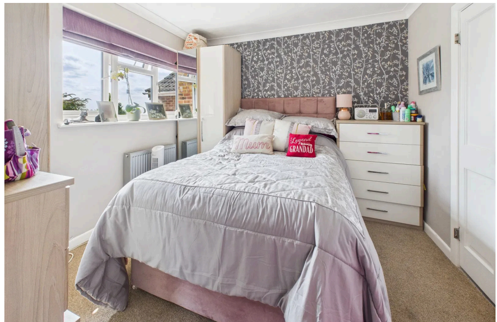
Property details: Holmbush Way | Southwick | BN42 4YA